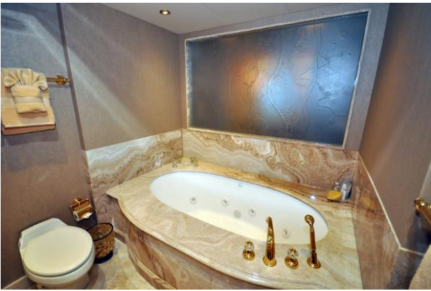
Master His & Her Bath