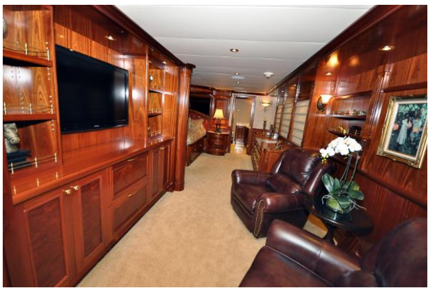
Master Stateroom Sitting Area