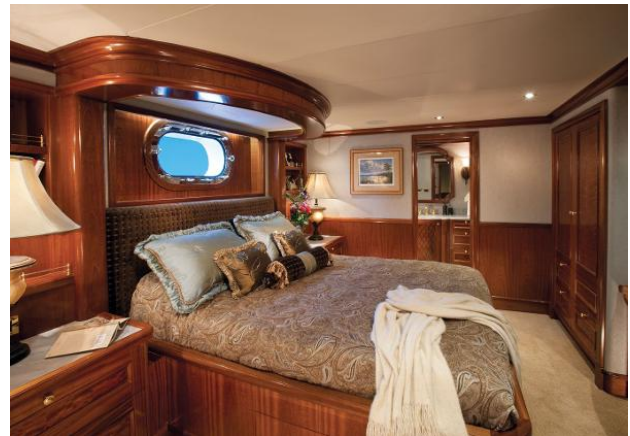
Queen Guest Stateroom