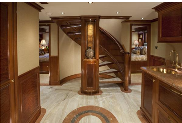
Lower Deck Foyer