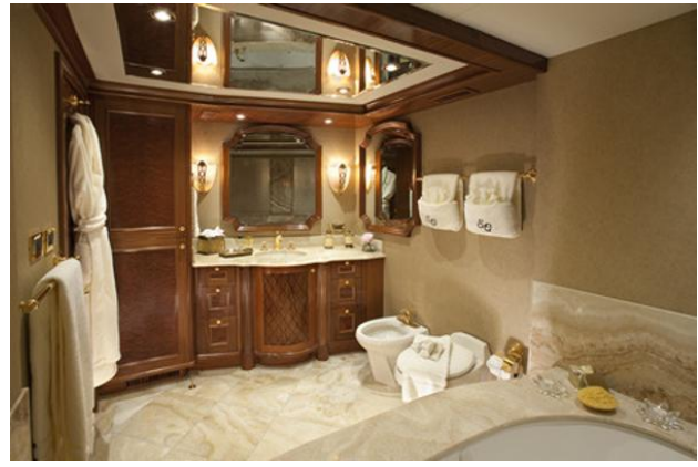
Master His & Her Bath