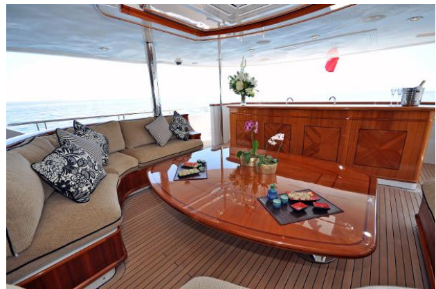
Lower Aft Deck