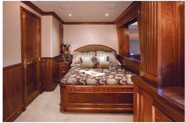
Queen Guest/Captain's Stateroom