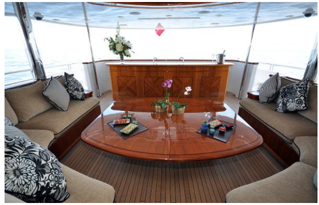
Lower Aft Deck