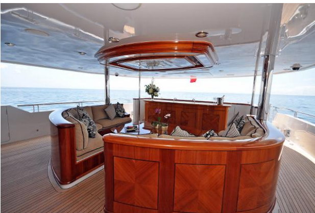
Lower Aft Deck