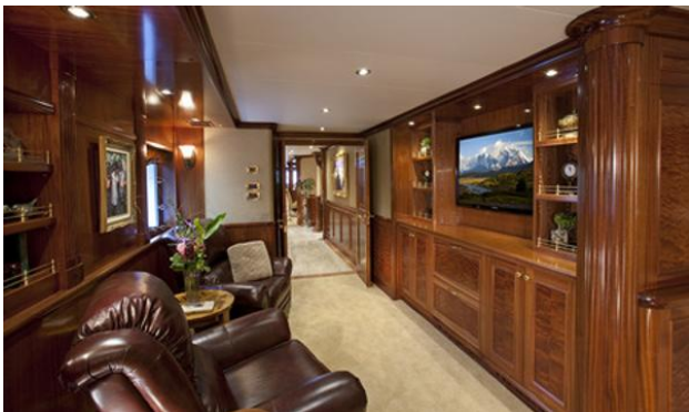
Master Stateroom Sitting Area