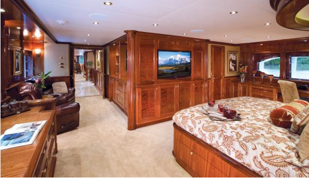
Master Stateroom, Aft