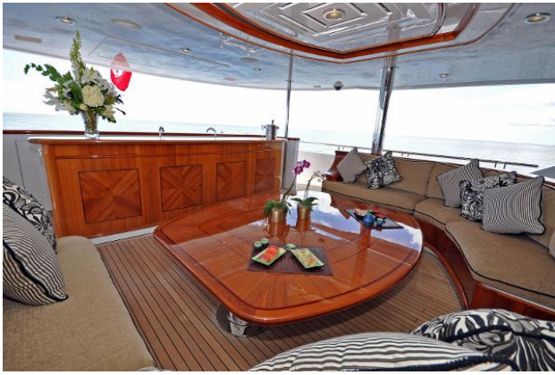
Lower Aft Deck