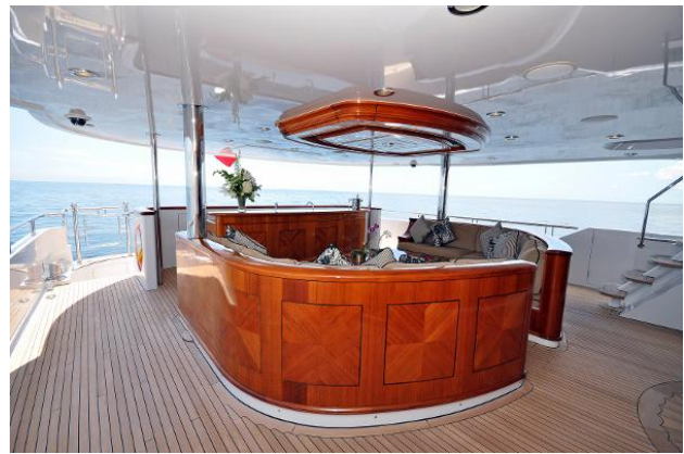
Lower Aft Deck