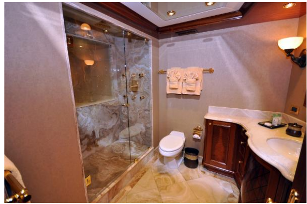
Master His & Her Bath