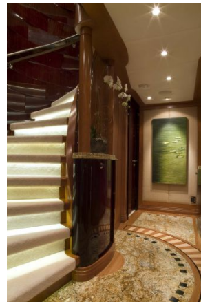
Staircase and Marble Flooring Detail