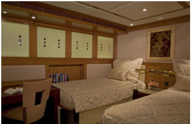
Guest Stateroom - Twin