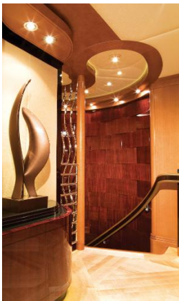
Entry to Lower Stairway