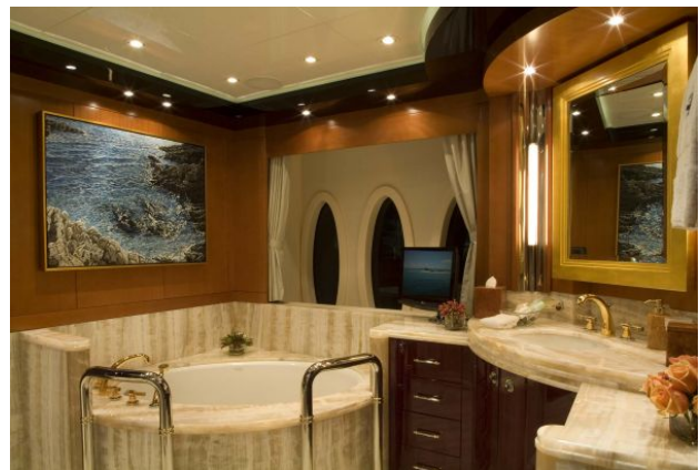
Master Bath - Hers