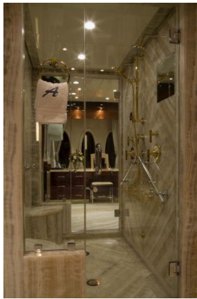
Master Bath - Shower