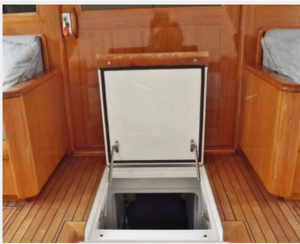
Engine Room Entry