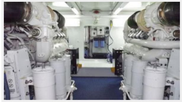
Engine Room Forward