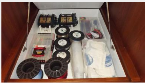
Dinette Floor Storage