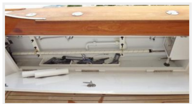
Cockpit Side Storage