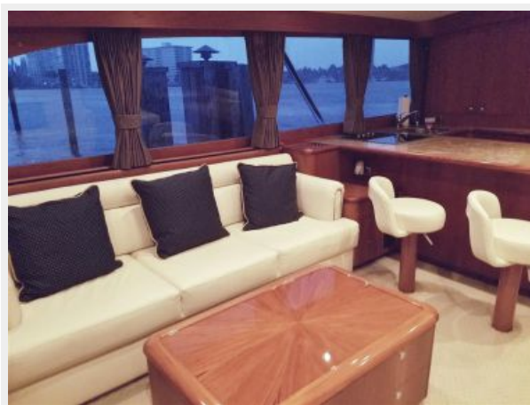
Custom Salon Couch