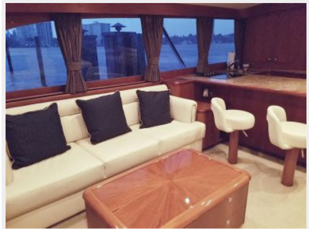
Custom Salon Couch