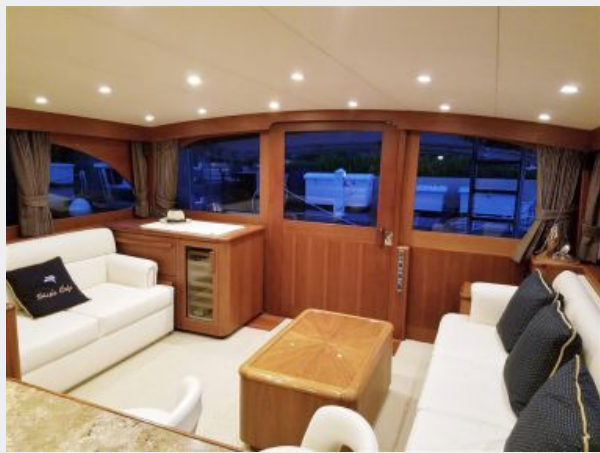
Custom Salon Couches