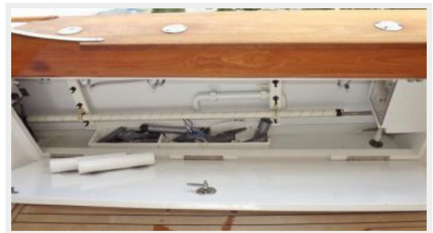
Cockpit Side Storage