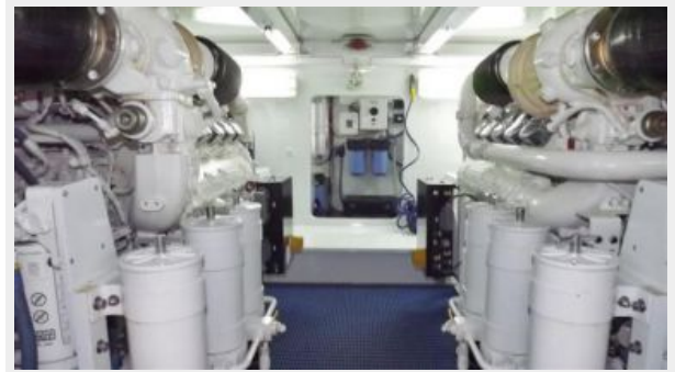
Engine Room Forward