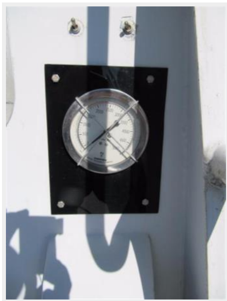
Air Pressure Gauge Cockpit