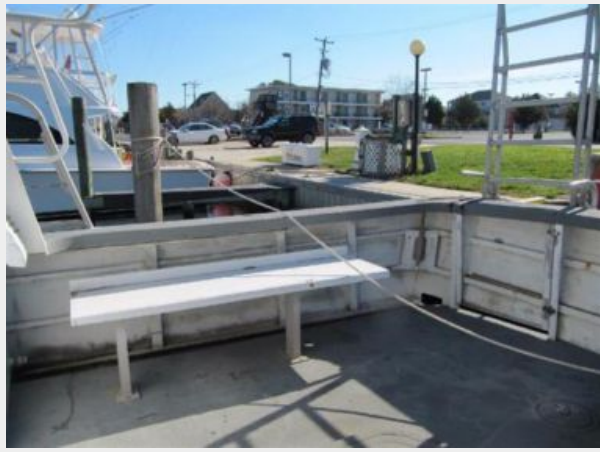
Starboard Cockpit Seating