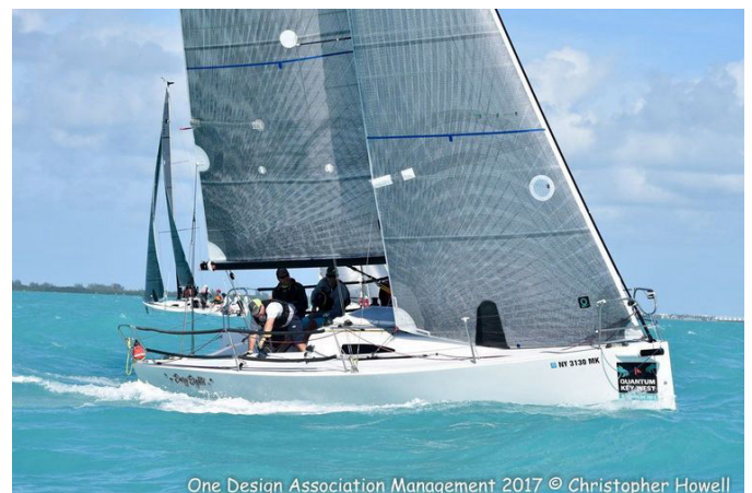
One Design Association Management 2017