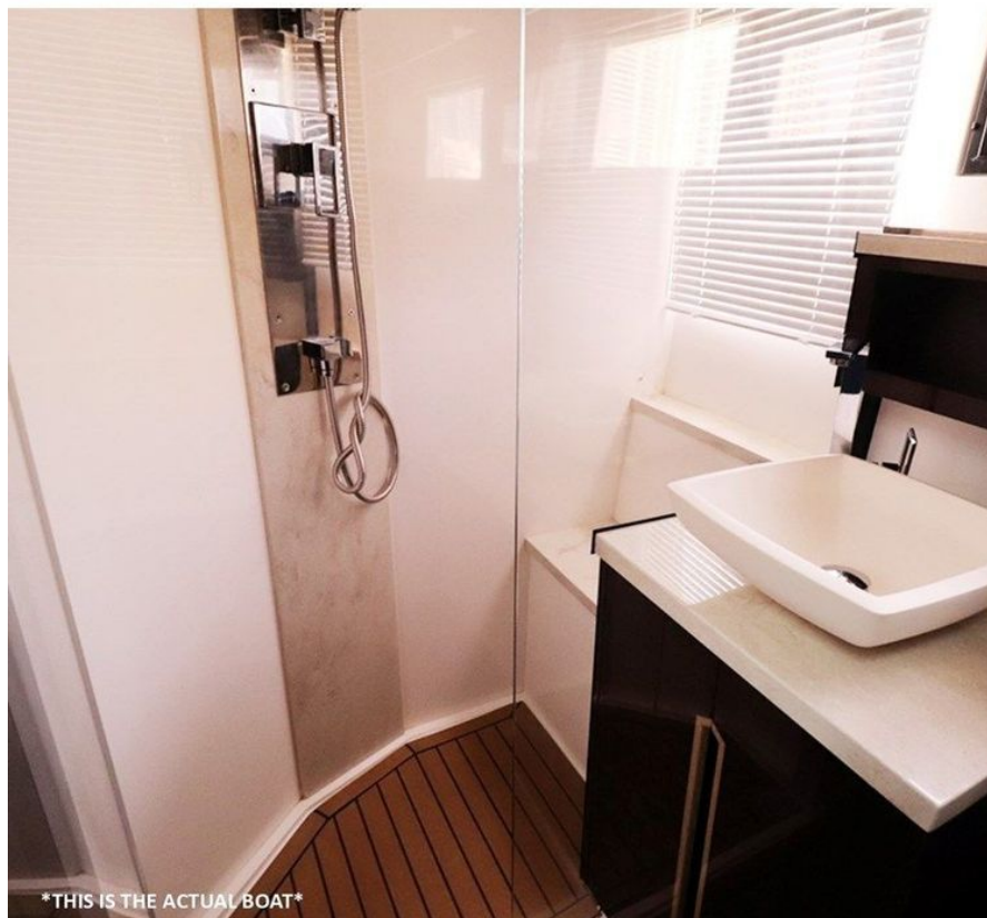
GALEON 500 FLY 2017