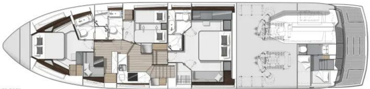
LOWER DECK Shown with optional sliding access door to the guest cabin.