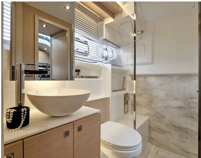
Jeanneau DB 43