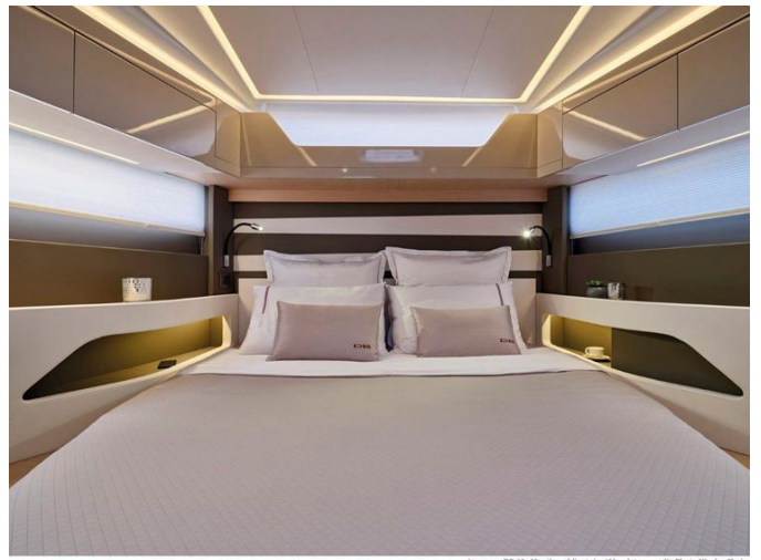
Jeanneau DB 43