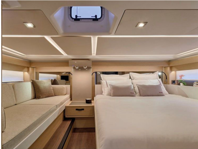
Jeanneau DB 43 - Mention obligatoire / Mandatory credit: Photo Nicolas Claris