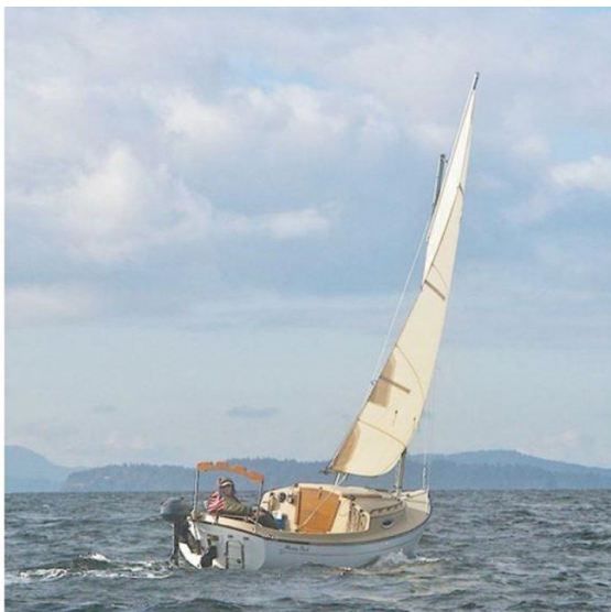
Rosario Strait in the San Juan Islands, WA