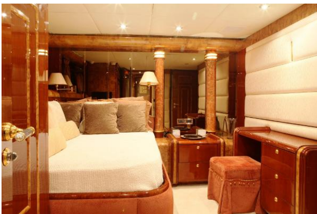
118 MILLENNIUM SUPER YACHT