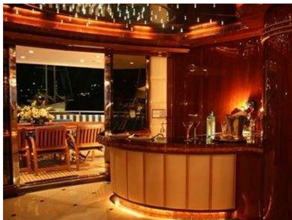
118 MILLENNIUM SUPER YACHT