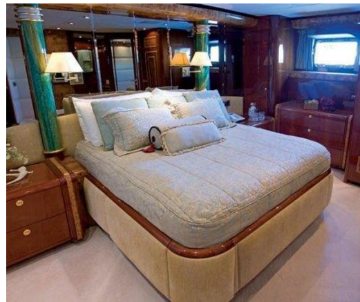
118 MILLENNIUM SUPER YACHT