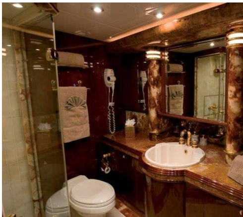
118 MILLENNIUM SUPER YACHT