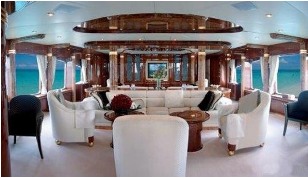
118 MILLENNIUM SUPER YACHT