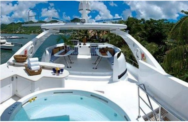
118 MILLENNIUM SUPER YACHT