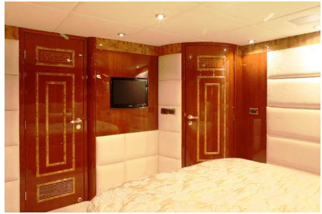
118 MILLENNIUM SUPER YACHT