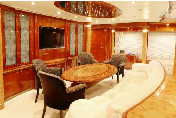
118 MILLENNIUM SUPER YACHT