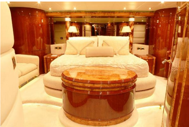
118 MILLENNIUM SUPER YACHT