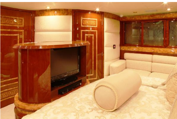
118 MILLENNIUM SUPER YACHT