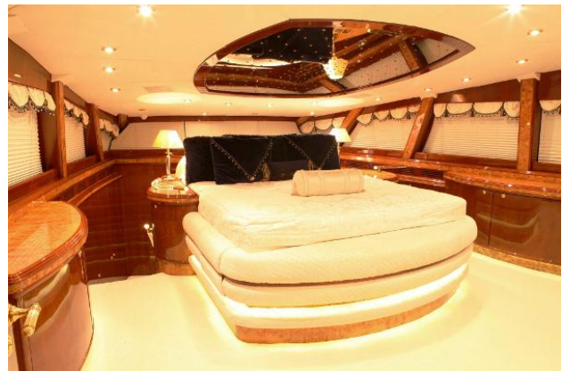
118 MILLENNIUM SUPER YACHT