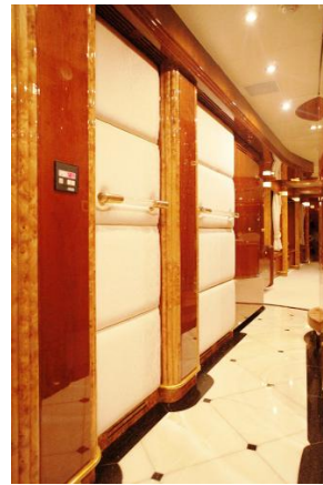
118 MILLENNIUM SUPER YACHT