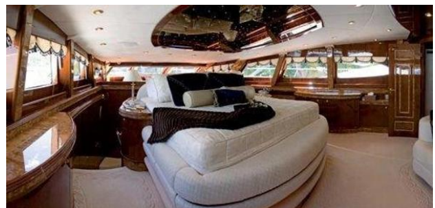
118 MILLENNIUM SUPER YACHT