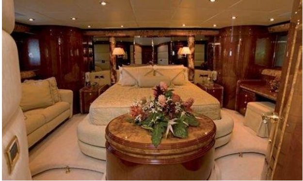
118 MILLENNIUM SUPER YACHT