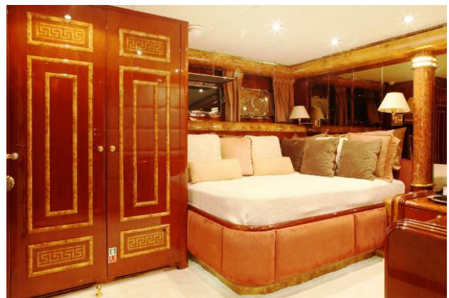
118 MILLENNIUM SUPER YACHT