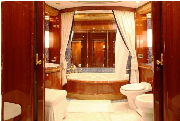
118 MILLENNIUM SUPER YACHT