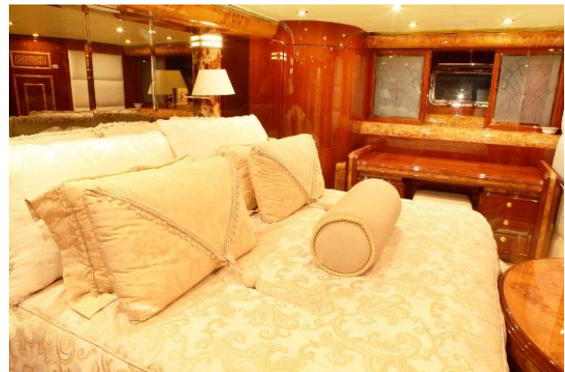
118 MILLENNIUM SUPER YACHT