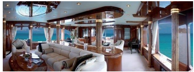
118 MILLENNIUM SUPER YACHT