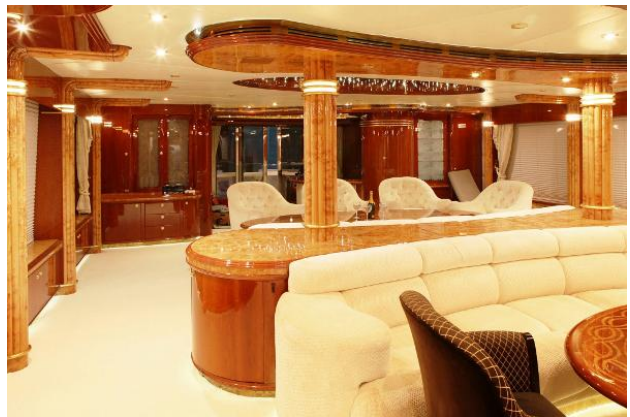
118 MILLENNIUM SUPER YACHT