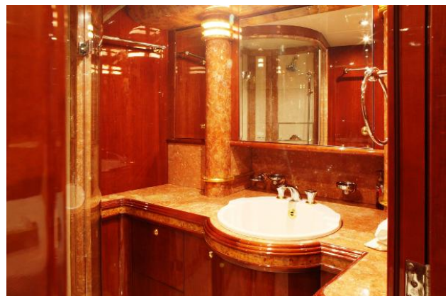
118 MILLENNIUM SUPER YACHT