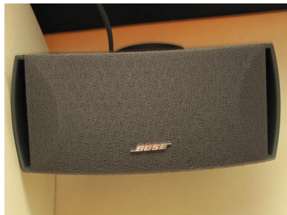
Fairline Phantom BOSE Speakers