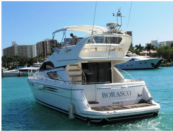
Fairline Phantom Profile