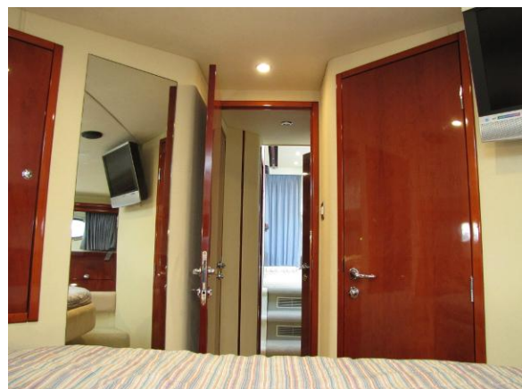
Fairline Phantom Master Stateroom