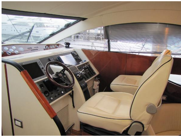
Fairline Phantom Pilothouse