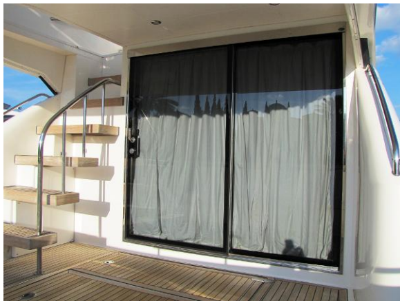
Fairline Phantom Aft Deck