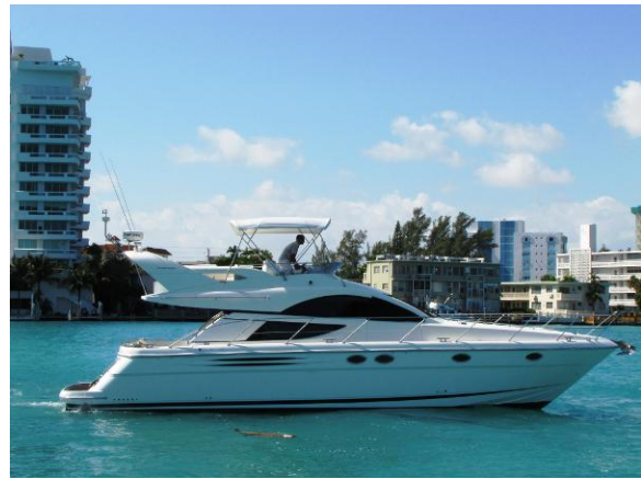
Fairline Phantom Profile