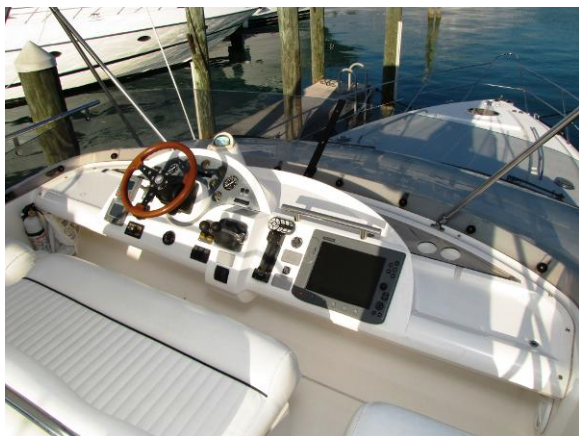
Fairline Phantom Flybridge