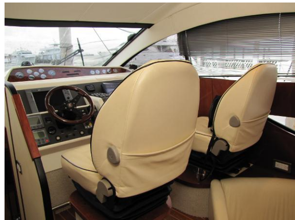
Fairline Phantom Pilothouse