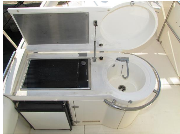
Fairline Phantom Flybridge