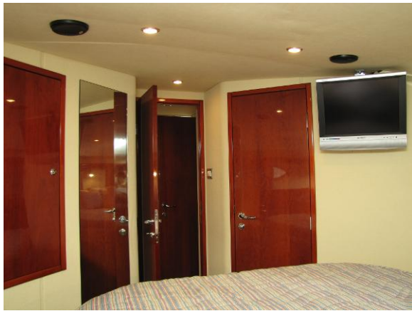
Fairline Phantom Master Stateroom