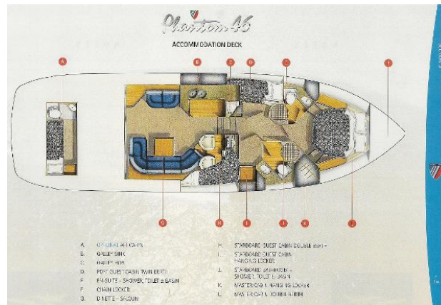
Fairline Phantom Accommodation Deck