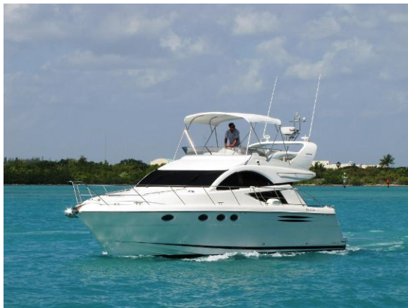
Fairline Phantom Profile