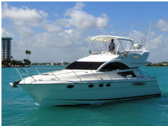
Fairline Phantom Profile