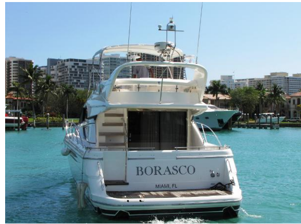
Fairline Phantom Profile