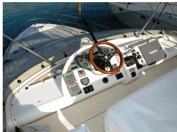
Fairline Phantom Flybridge