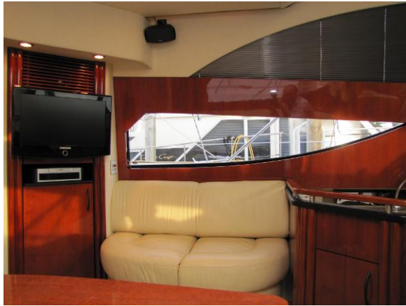
Fairline Phantom Salon