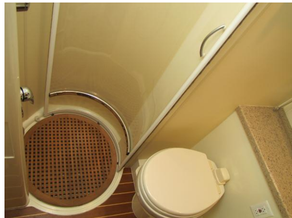
Fairline Phantom Master Head