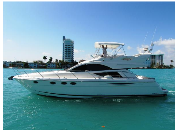
Fairline Phantom Profile