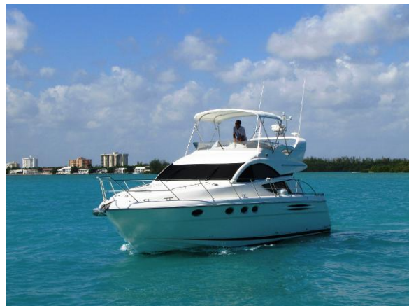
Fairline Phantom Profile