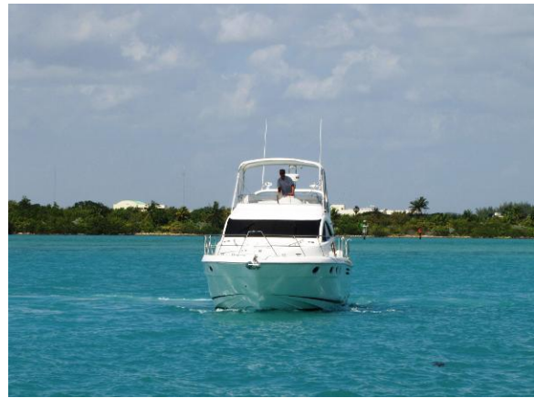
Fairline Phantom Profile