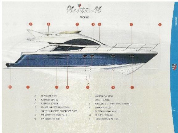
Fairline Phantom Profile