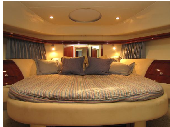
Fairline Phantom Master Stateroom