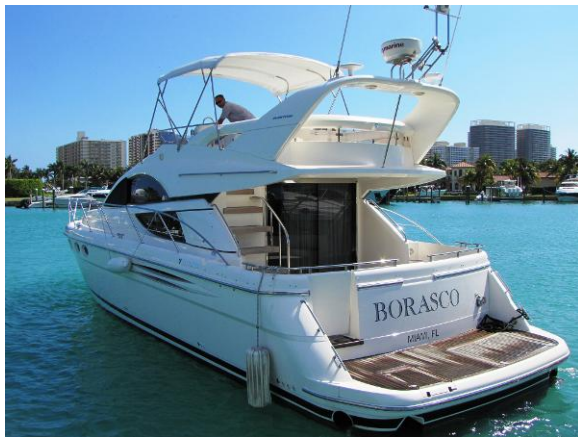
Fairline Phantom Profile