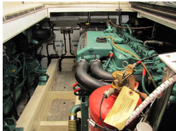
Fairline Phantom Engine Room