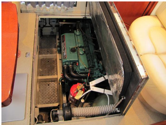
Fairline Phantom Engine Room