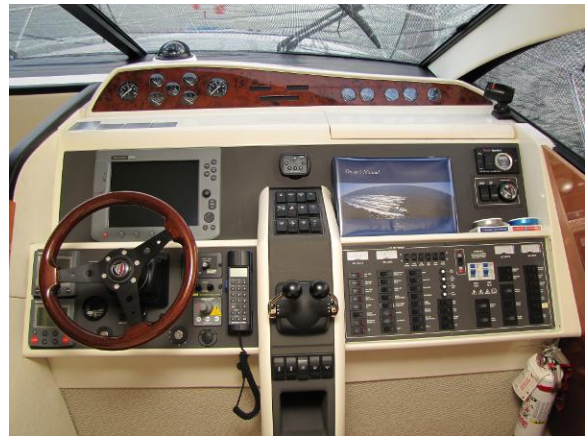
Fairline Phantom Pilothouse