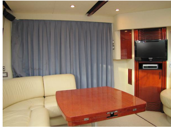
Fairline Phantom Salon