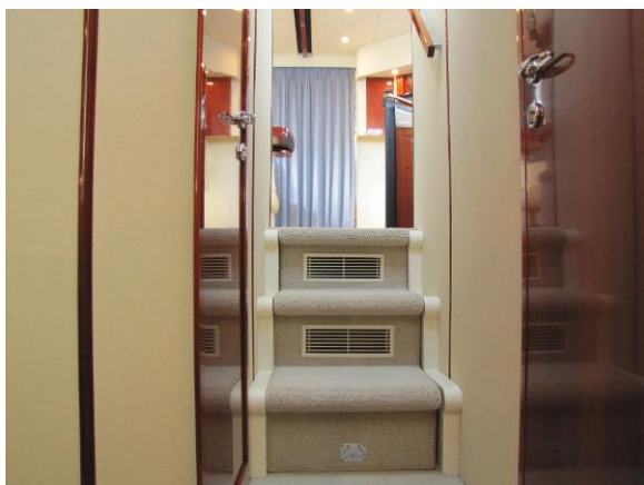
Fairline Phantom Hallway