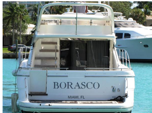
Fairline Phantom Profile