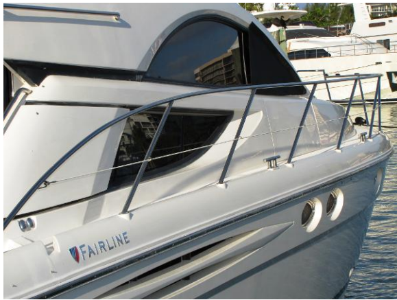
Fairline Phantom Profile