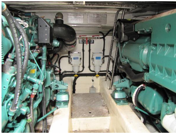
Fairline Phantom Engine Room