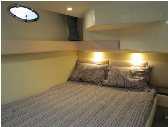
Fairline Phantom Guest Stateroom