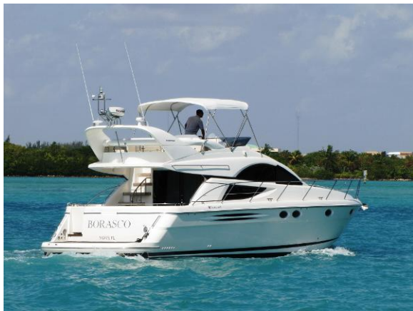
Fairline Phantom Profile