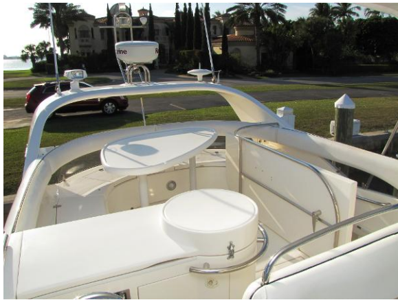
Fairline Phantom Flybridge