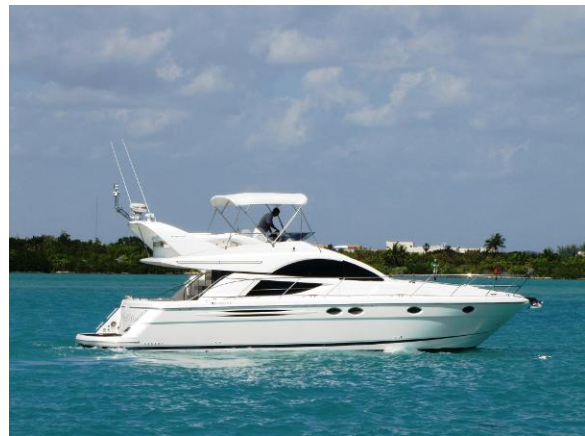
Fairline Phantom Profile