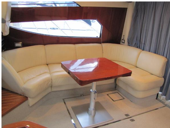
Fairline Phantom Salon