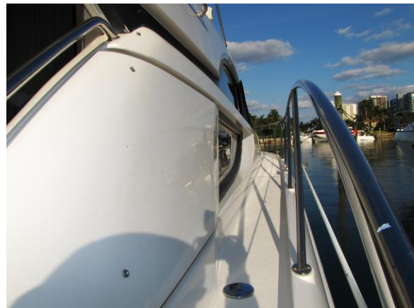
Fairline Phantom Walk-around decks