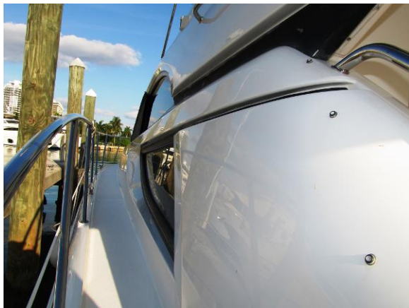
Fairline Phantom Walk-around decks