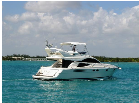
Fairline Phantom Profile