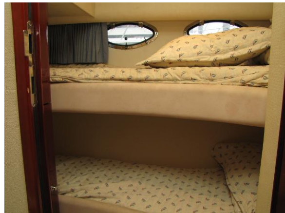
Fairline Phantom Guest Stateroom