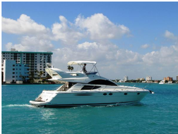
Fairline Phantom Profile