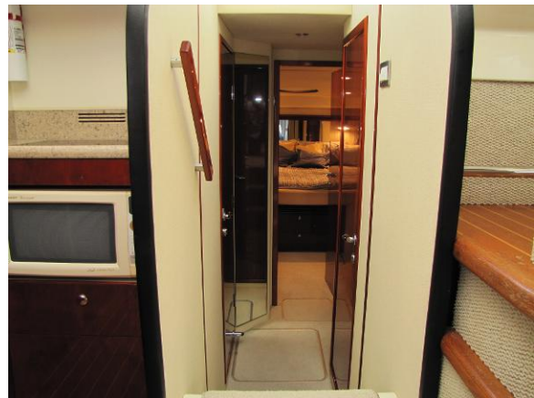
Fairline Phantom Hallway