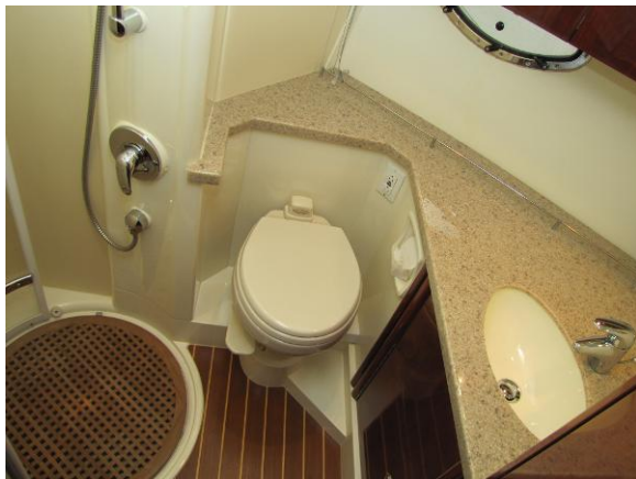
Fairline Phantom Master Head