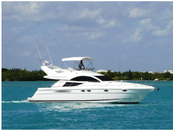
Fairline Phantom Profile