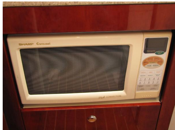
Fairline Phantom Galley