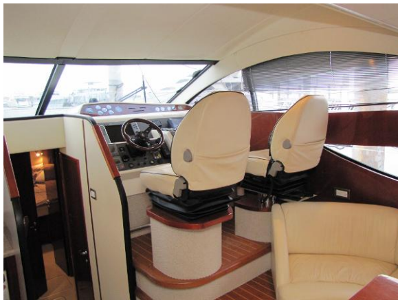
Fairline Phantom Pilothouse