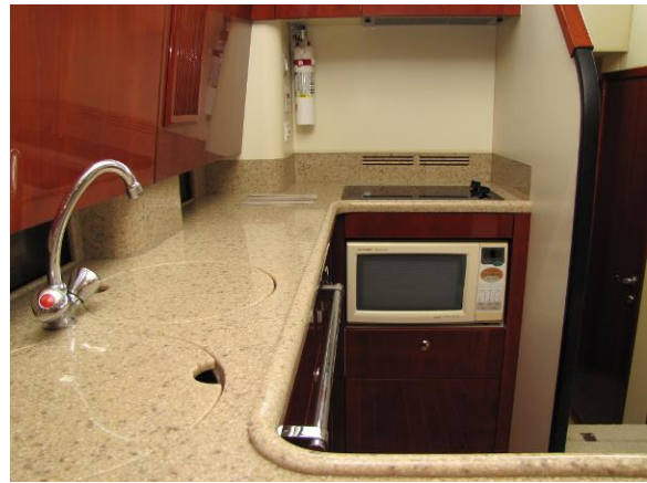
Fairline Phantom Galley