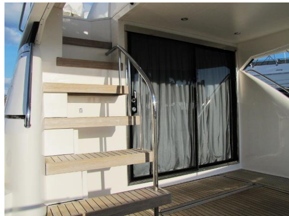
Fairline Phantom Aft Deck