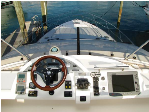
Fairline Phantom Flybridge