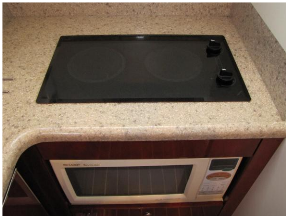
Fairline Phantom Galley