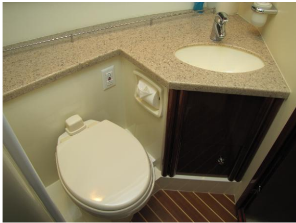
Fairline Phantom Stateroom Head