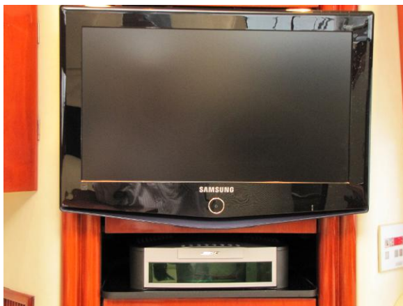
Fairline Phantom TV Station