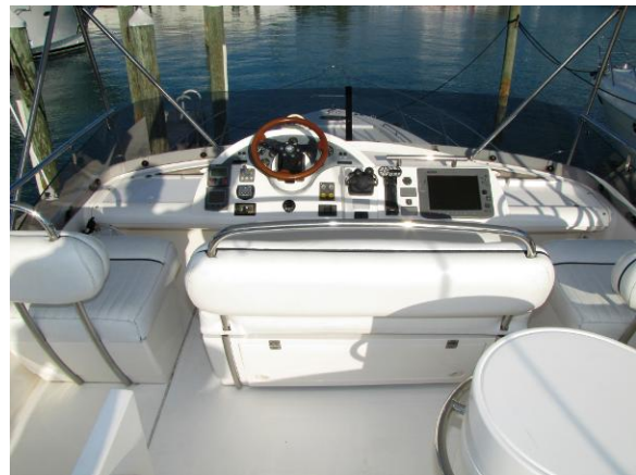
Fairline Phantom Flybridge