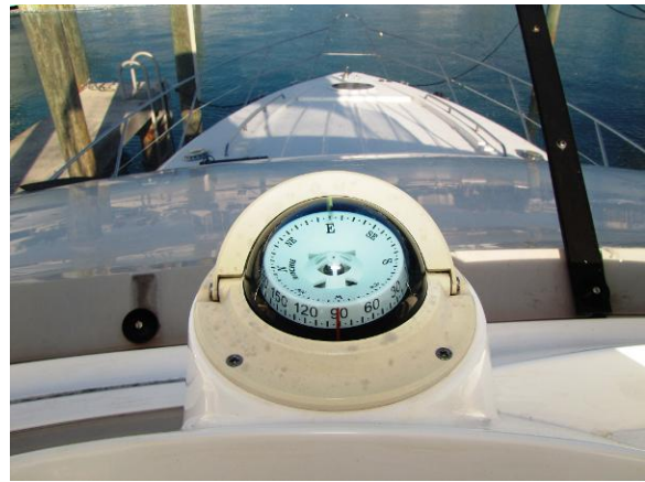
Fairline Phantom Flybridge