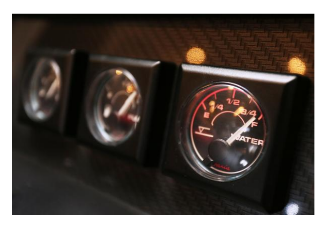
Pacific Mariner Gauges