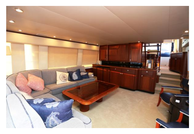
Pacific Mariner Salon