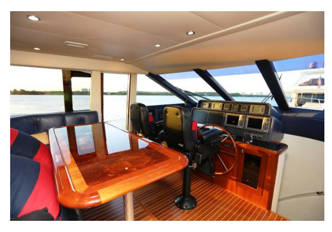
Pacific Mariner Pilothouse