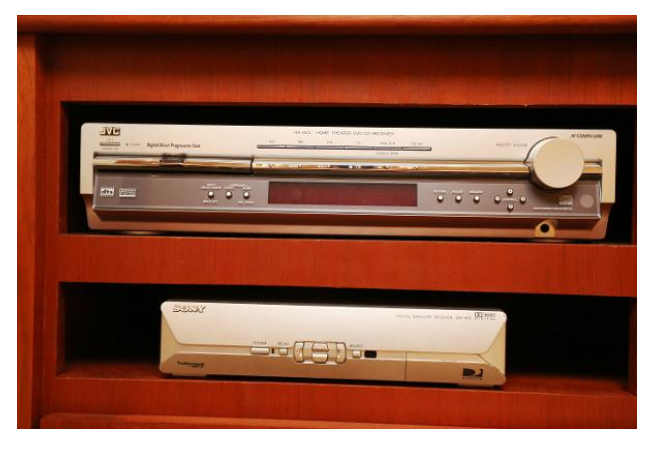
Pacific Mariner Video Audio