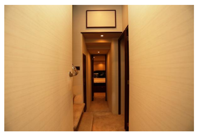
Pacific Mariner Hallway