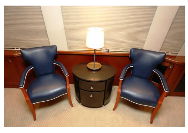
Pacific Mariner Salon