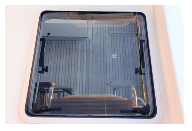
Pacific Mariner Exit Stairs