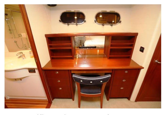
Pacific Mariner Master Stateroom