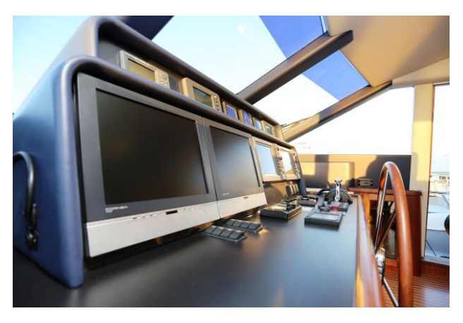
Pacific Mariner Pilothouse