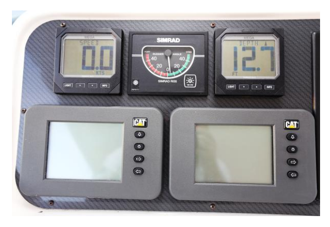
Pacific Mariner Flybridge