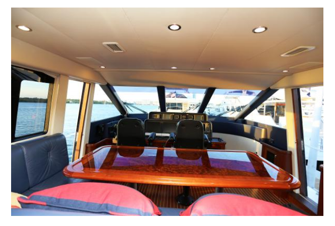
Pacific Mariner Pilothouse