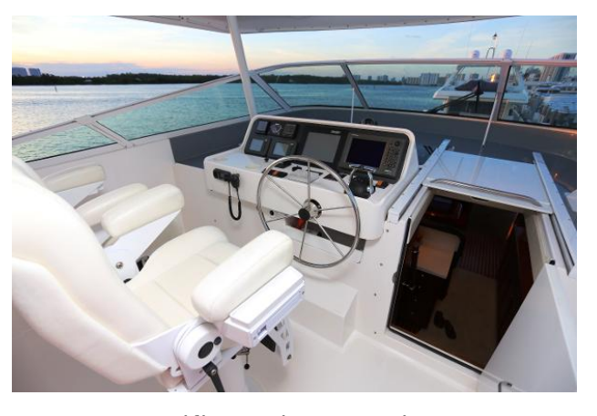
Pacific Mariner Flybridge