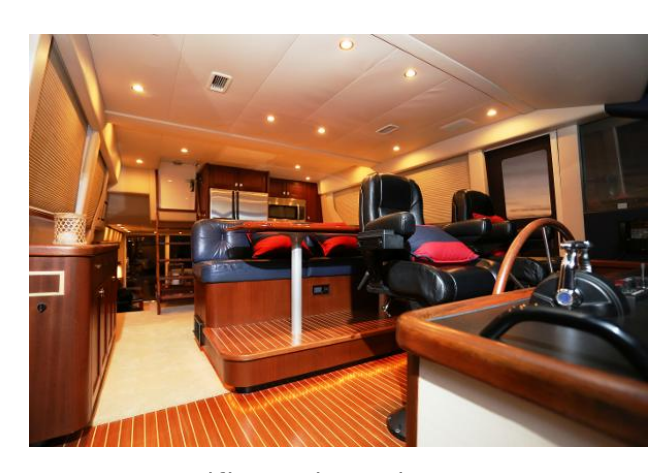
Pacific Mariner Pilothouse