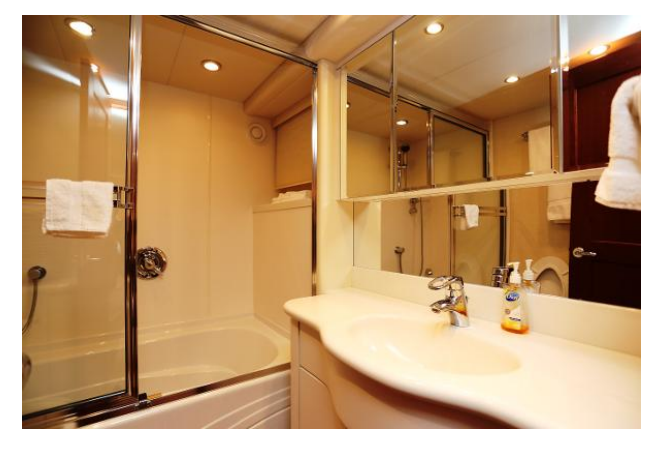
Pacific Mariner Master Bath