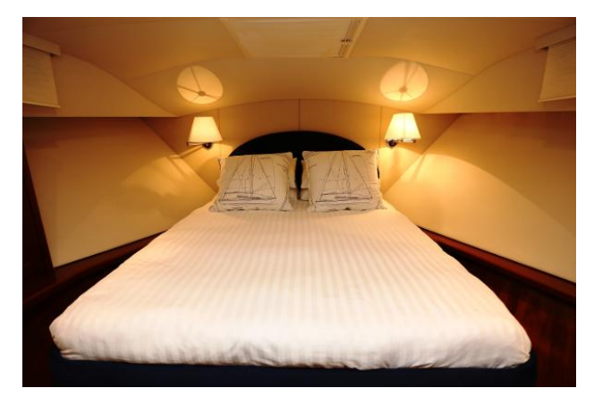
Pacific Mariner VIP Stateroom