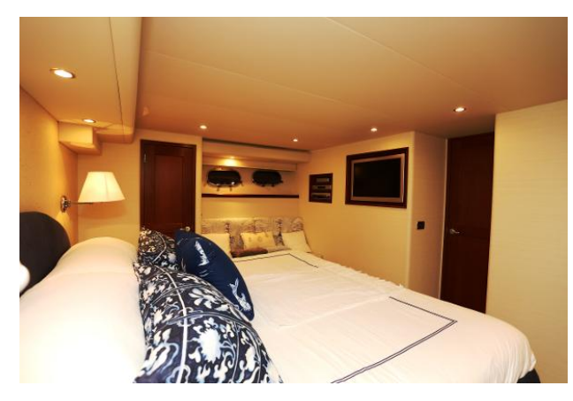
Pacific Mariner Master Stateroom