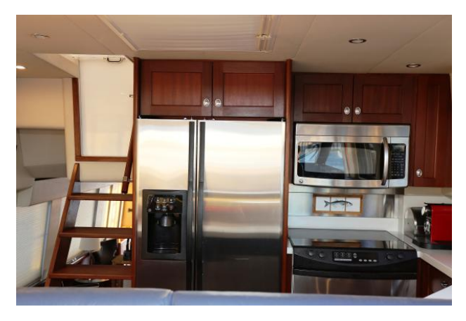
Pacific Mariner Galley