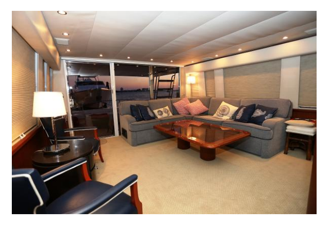
Pacific Mariner Salon