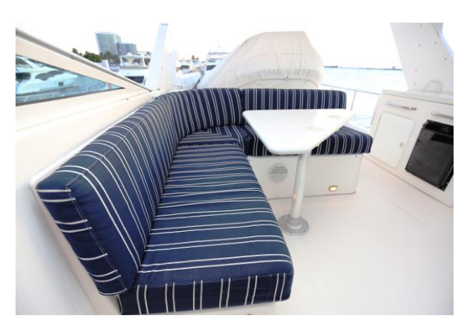
Pacific Mariner Flybridge