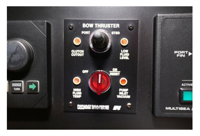
Pacific Mariner Bow Thruster