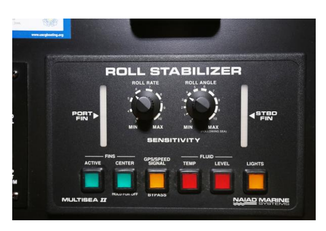
Pacific Mariner Stabilizer