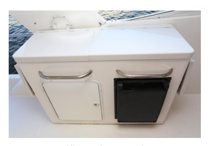
Pacific Mariner Flybridge