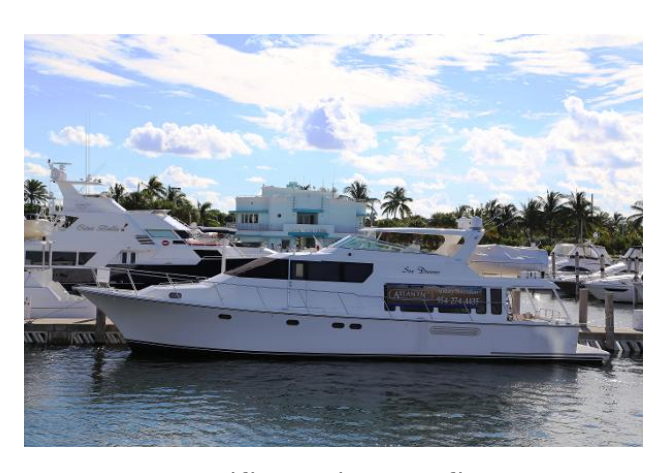
Pacific Mariner Profile