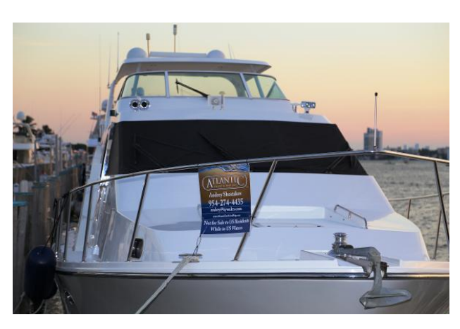
Pacific Mariner Profile