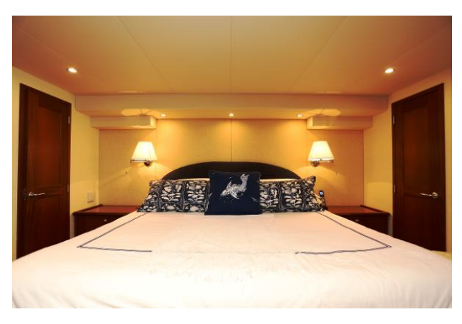
Pacific Mariner Master Stateroom