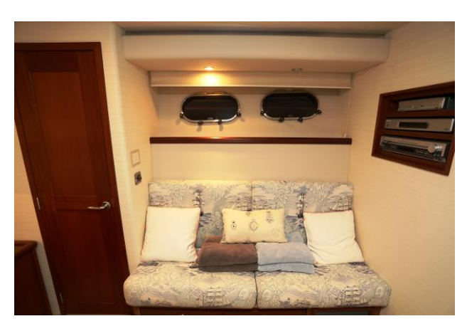
Pacific Mariner Master Stateroom