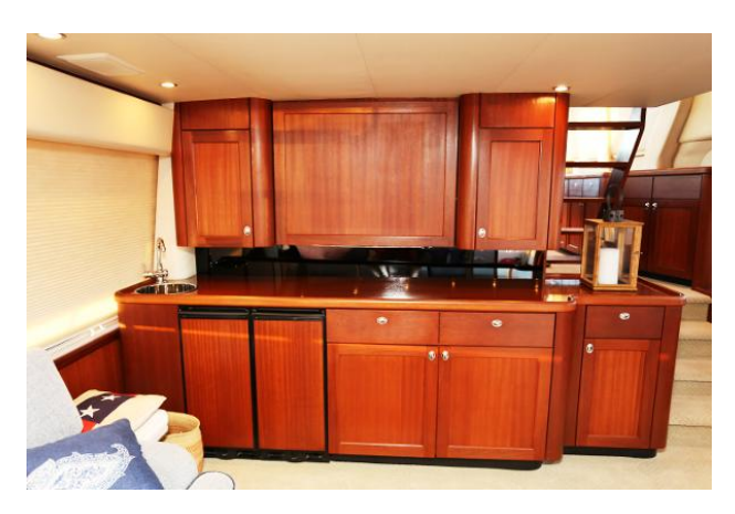
Pacific Mariner Salon