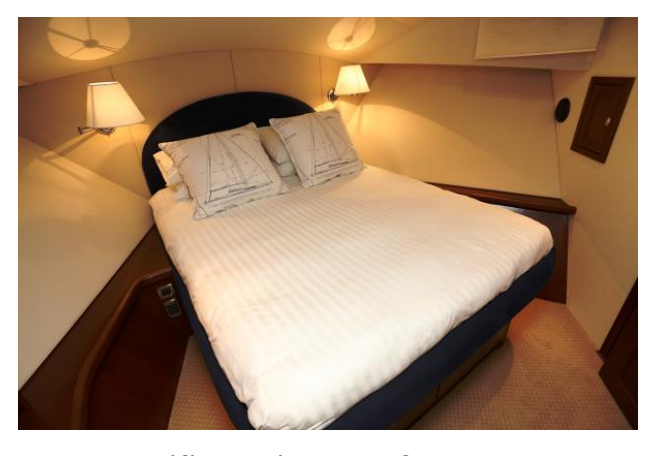
Pacific Mariner VIP Stateroom