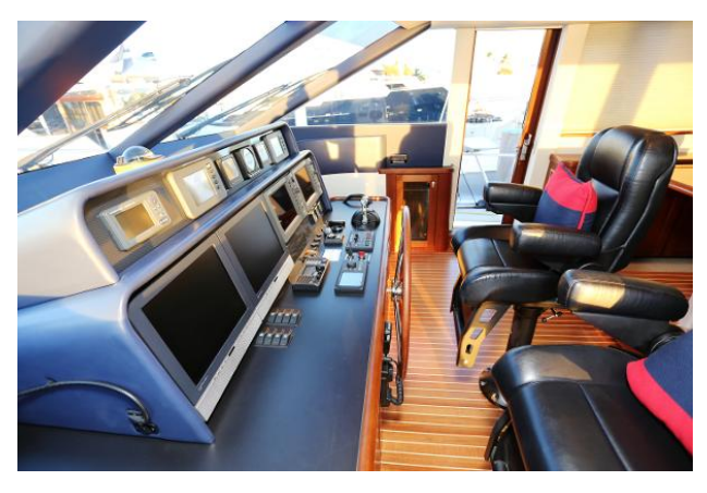
Pacific Mariner Pilothouse