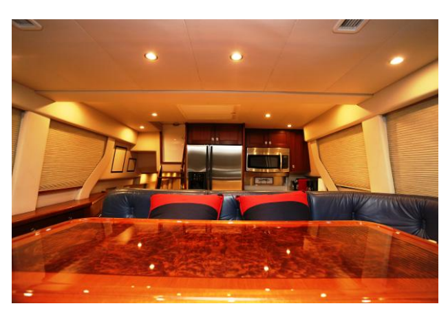
Pacific Mariner Galley