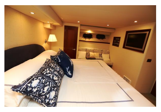
Pacific Mariner Master Stateroom