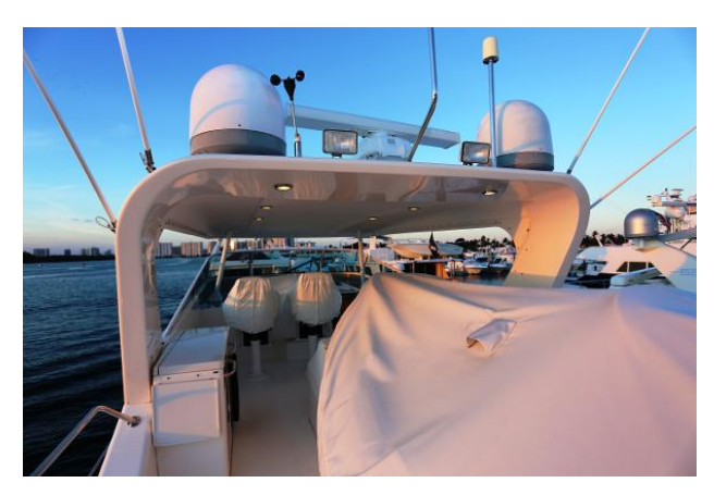
Pacific Mariner Flybridge