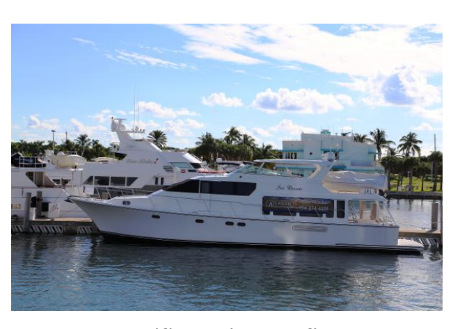
Pacific Mariner Profile