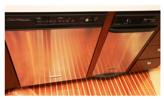
Pacific Mariner Galley