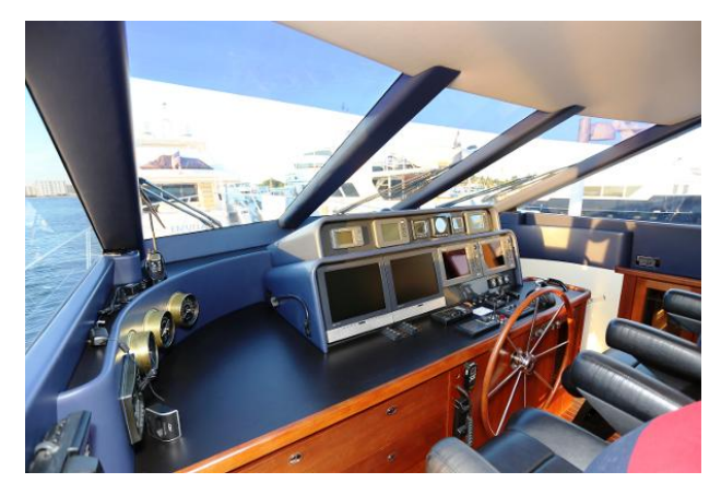
Pacific Mariner Pilothouse