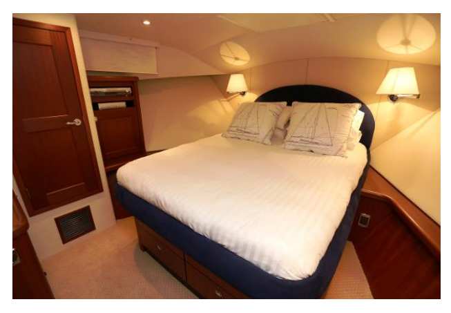
Pacific Mariner VIP Stateroom