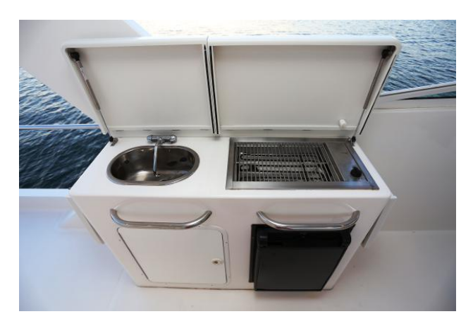
Pacific Mariner Flybridge