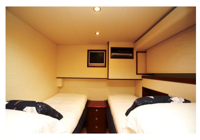
Pacific Mariner Guest Stateroom