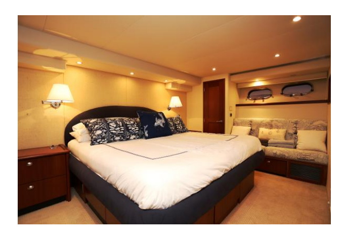
Pacific Mariner Master Stateroom