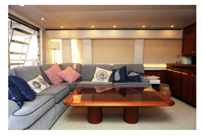
Pacific Mariner Salon