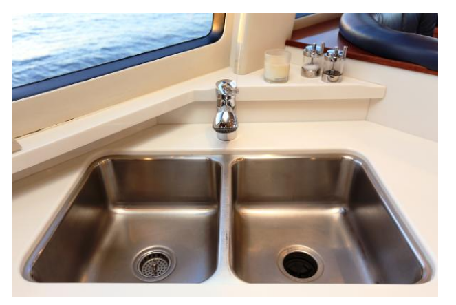
Pacific Mariner Galley