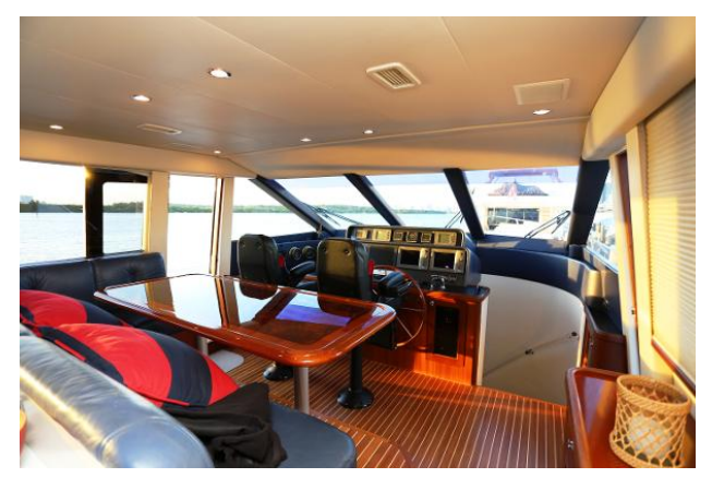
Pacific Mariner Pilothouse