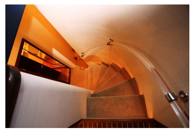
Pacific Mariner Exit Stairs