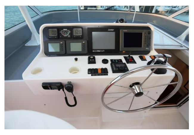
Pacific Mariner Flybridge