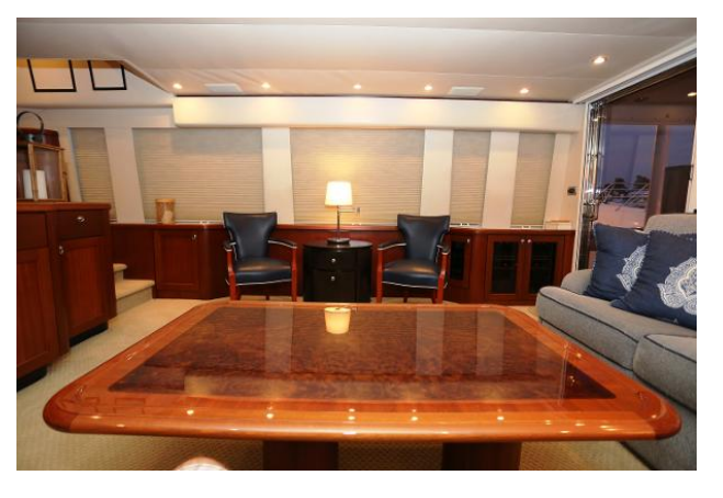
Pacific Mariner Salon