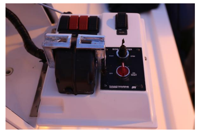
Pacific Mariner Wing Stations