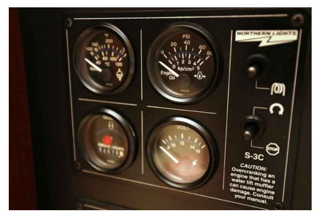
Pacific Mariner Generator Control