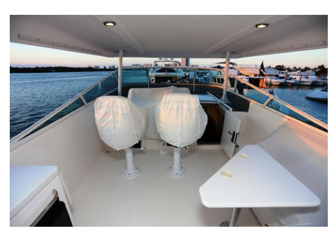
Pacific Mariner Flybridge