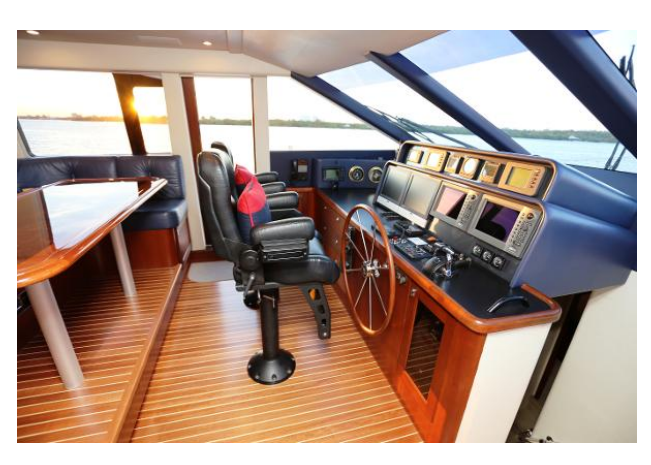
Pacific Mariner Pilothouse