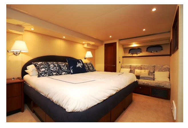
Pacific Mariner Master Stateroom