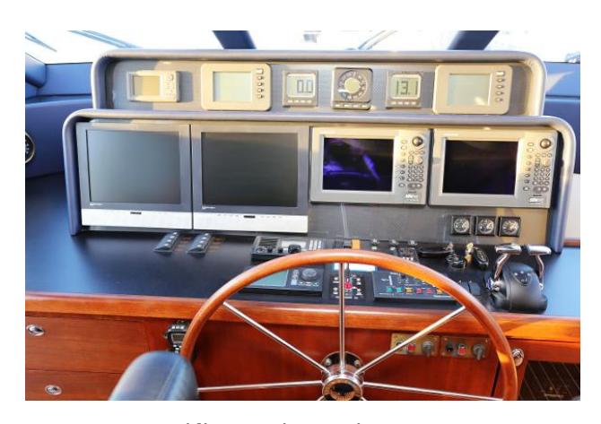
Pacific Mariner Pilothouse