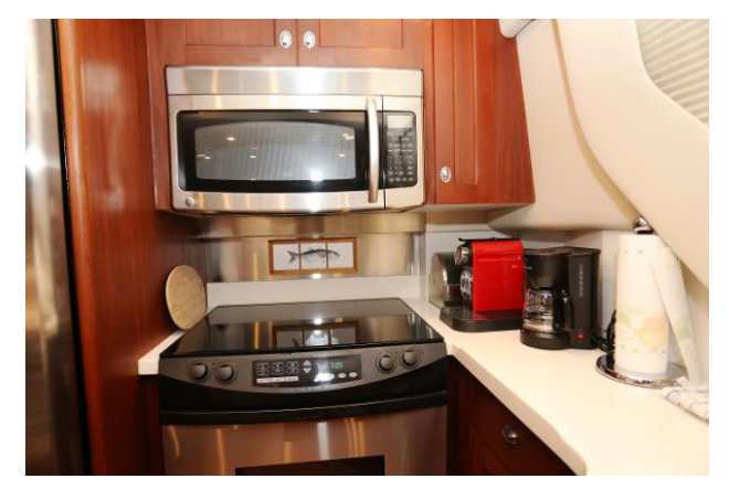
Pacific Mariner Galley