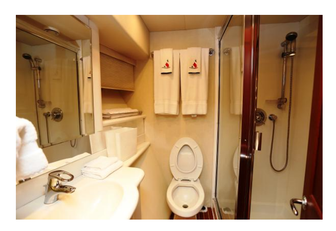
Pacific Mariner Guest Bath