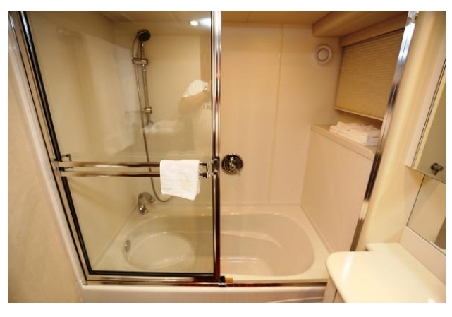
Pacific Mariner Master Bath