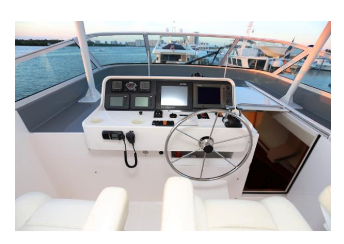
Pacific Mariner Flybridge