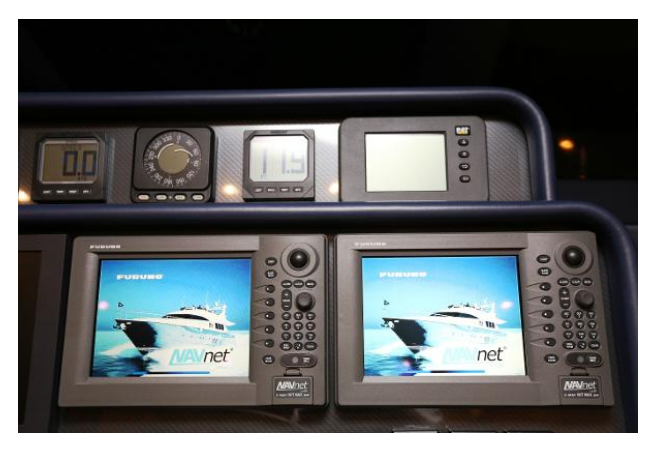
Pacific Mariner Electronics