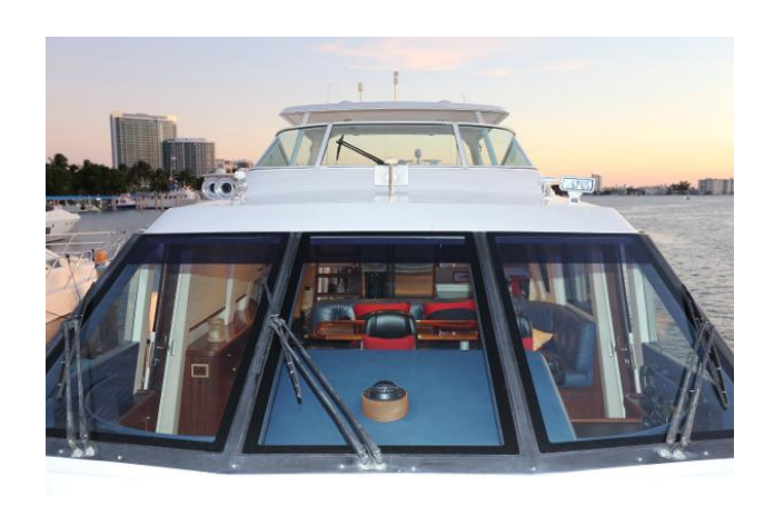
Pacific Mariner Pilothouse