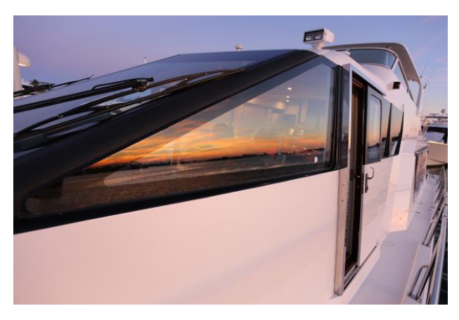
Pacific Mariner Walk Deck