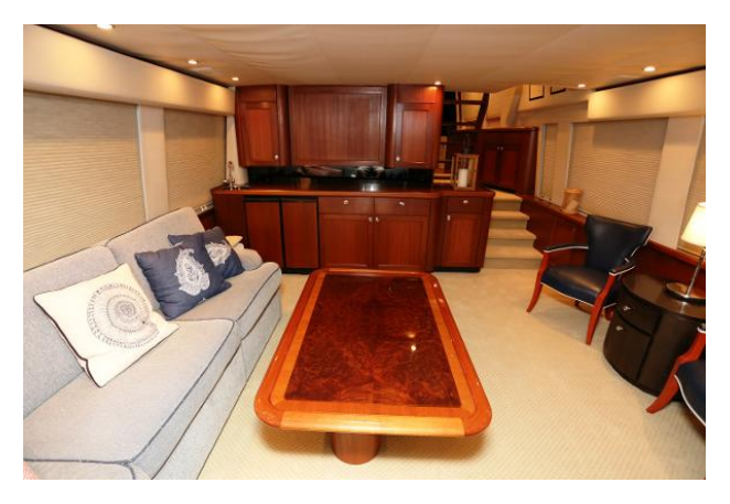
Pacific Mariner Salon