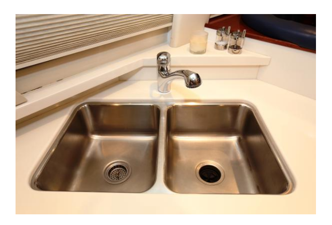
Pacific Mariner Galley