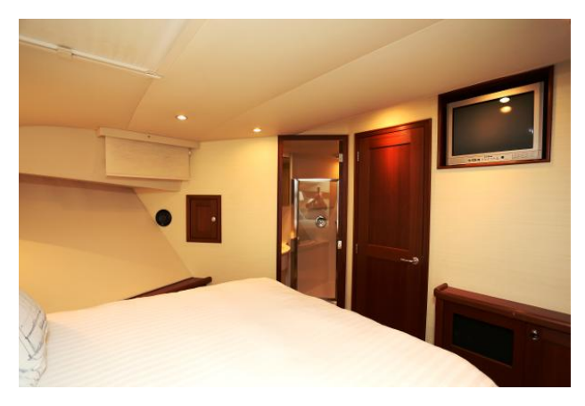
Pacific Mariner VIP Stateroom