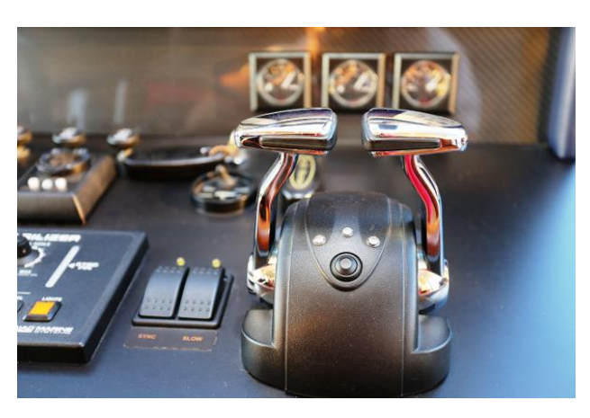
Pacific Mariner Pilothouse