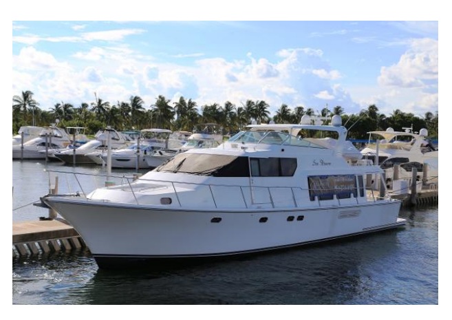
Pacific Mariner Profile