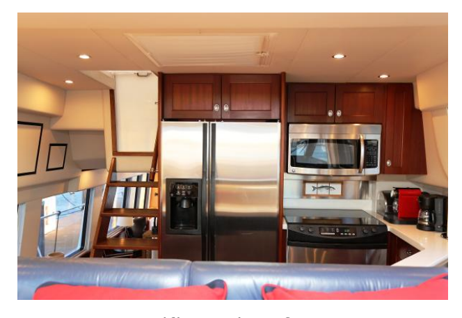
Pacific Mariner Galley