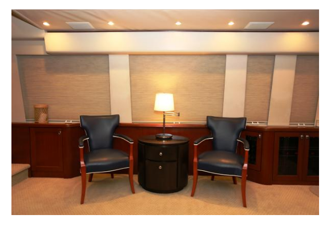
Pacific Mariner Salon