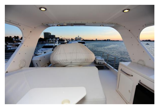
Pacific Mariner Flybridge