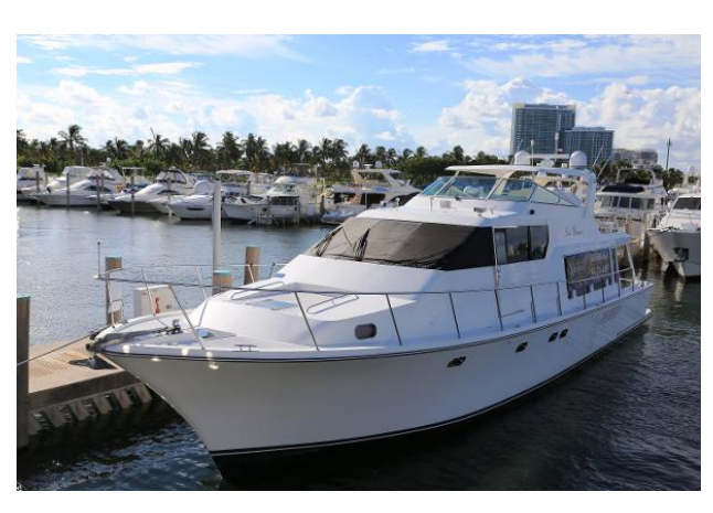
Pacific Mariner Profile