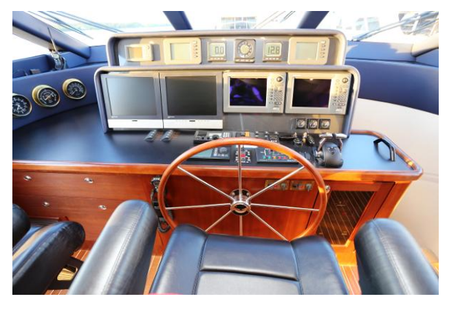
Pacific Mariner Pilothouse