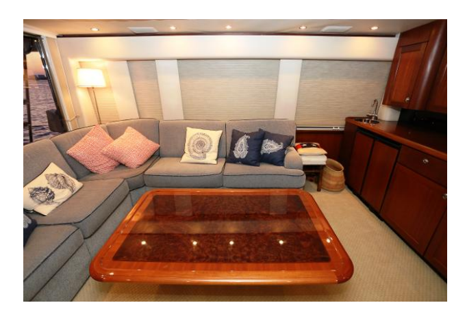
Pacific Mariner Salon