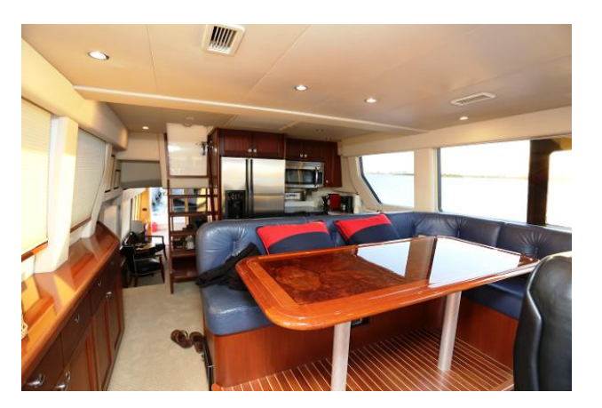
Pacific Mariner Pilothouse