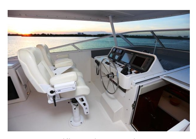
Pacific Mariner Flybridge