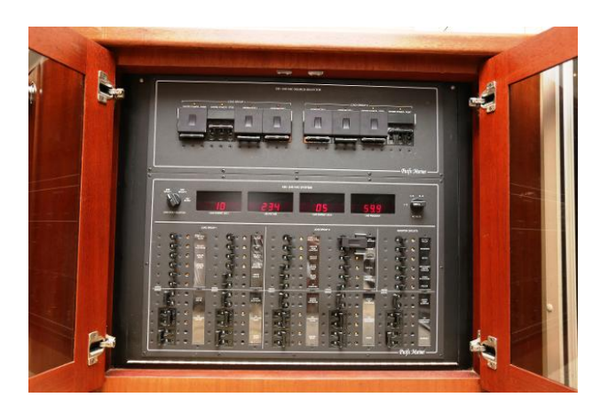
Pacific Mariner Electric Panel