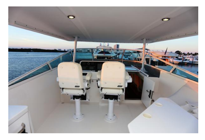
Pacific Mariner Flybridge