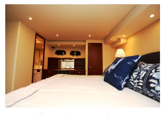
Pacific Mariner Master Stateroom