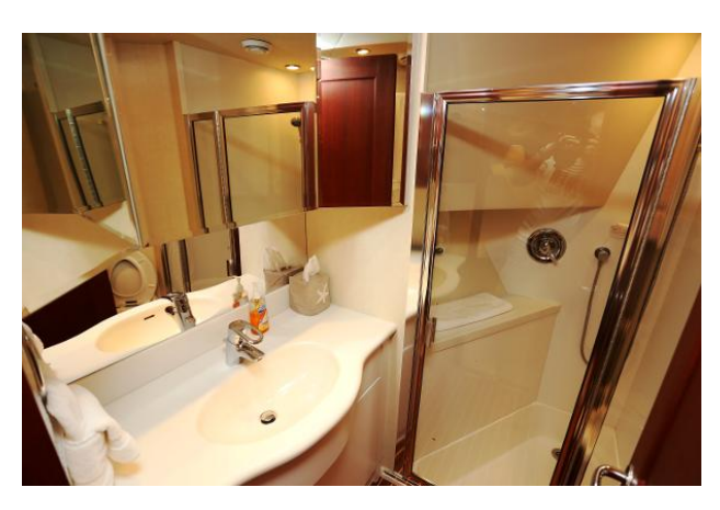
Pacific Mariner VIP Bath