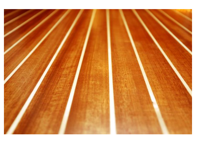
Pacific Mariner Wood Floor