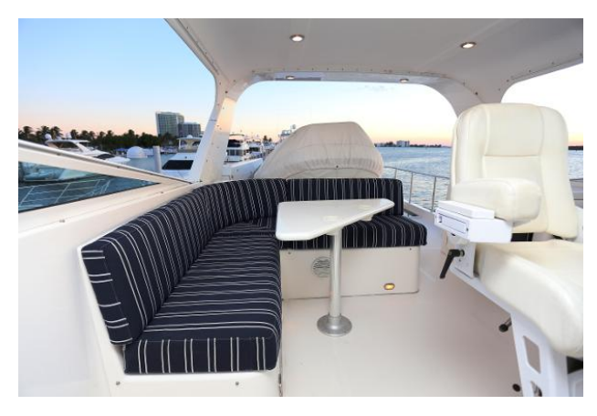
Pacific Mariner Flybridge