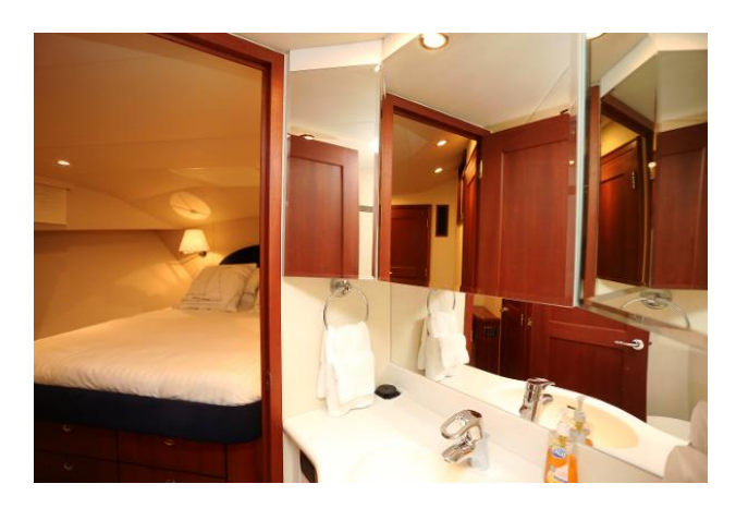
Pacific Mariner VIP Bath