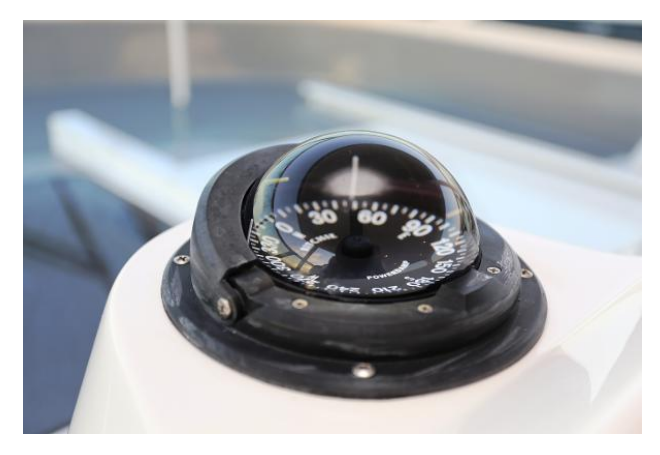
Pacific Mariner Flybridge Compass