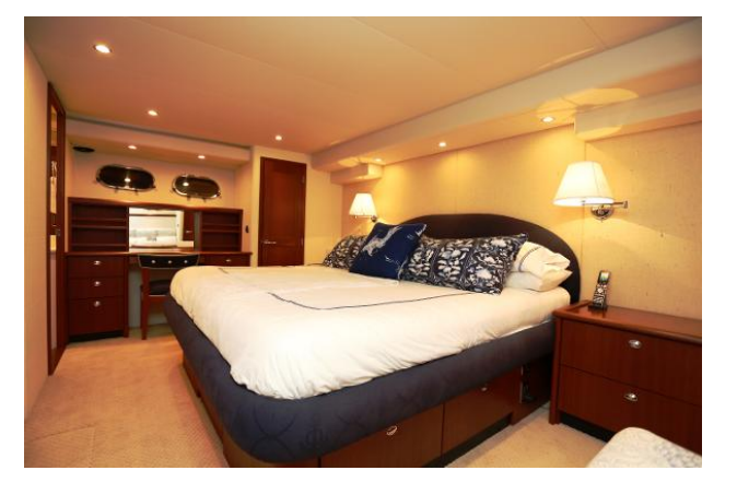
Pacific Mariner Master Stateroom