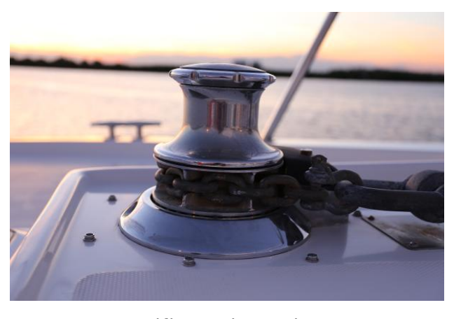
Pacific Mariner Winch