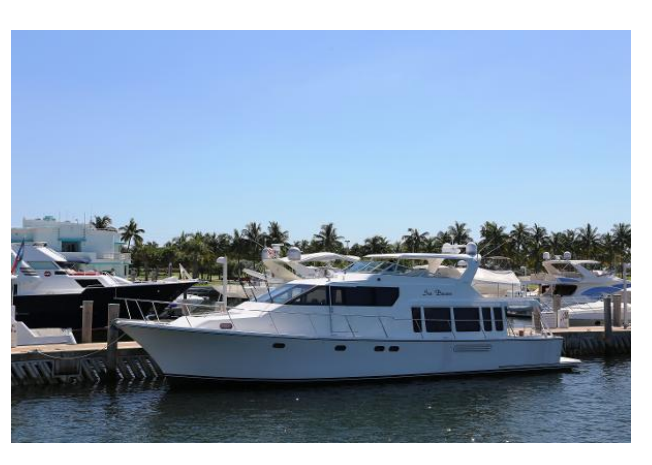
Pacific Mariner Profile