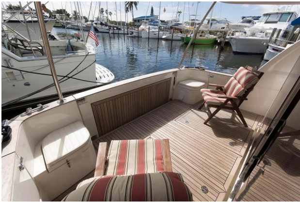
Cockpit To Starboard