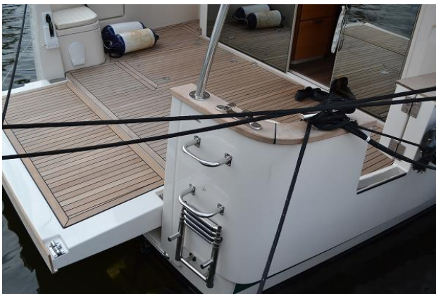
Fold Down Transom