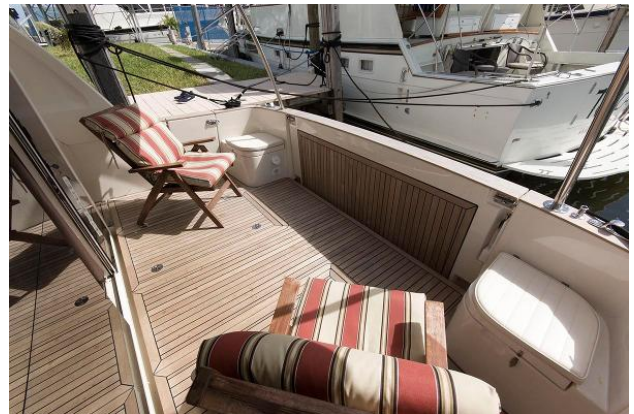
Cockpit To Port