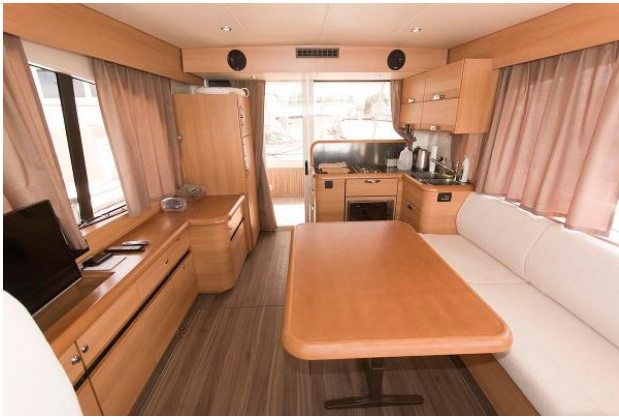
Salon View Aft