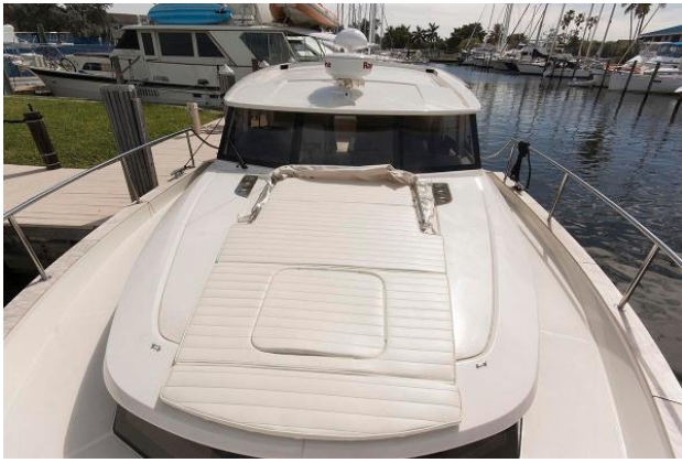
Sunpad with Bimini