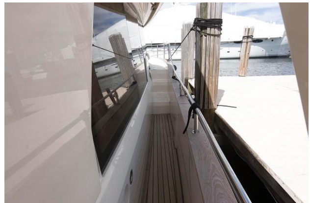
Starboard Side Deck