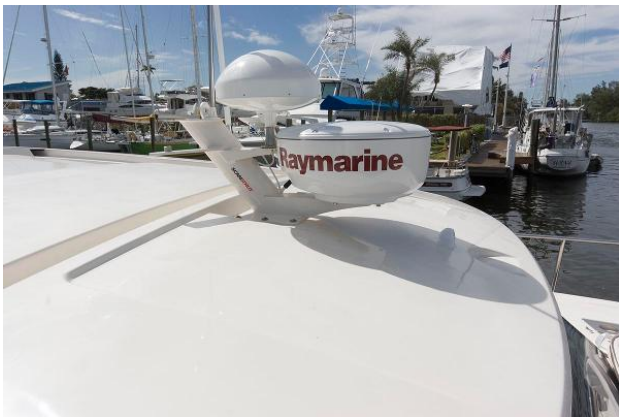
Radar & Sat TV