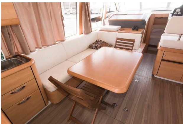
Dinette With Chairs