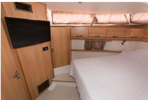
Master To Port