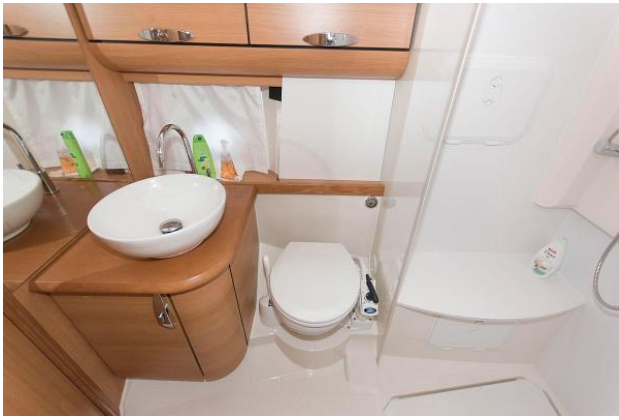
Head with Stall Shower