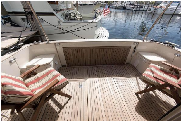
Cockpit From Salon