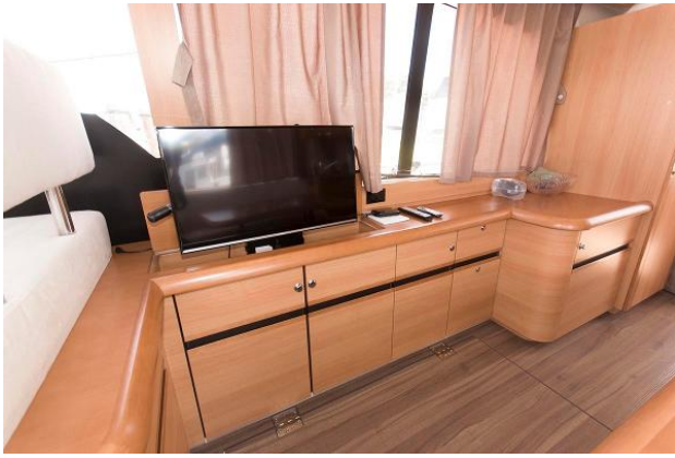
Salon Flat Screen