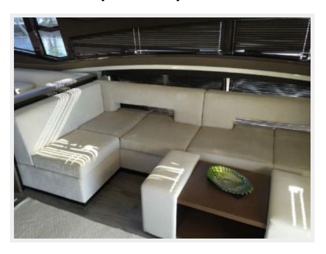
Marquis 630 Sport Yacht