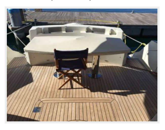
Marquis 630 Sport Yacht