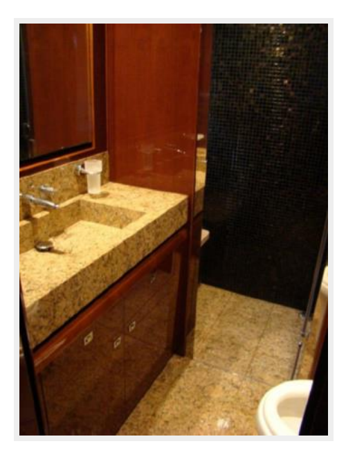
85 Princess Yacht