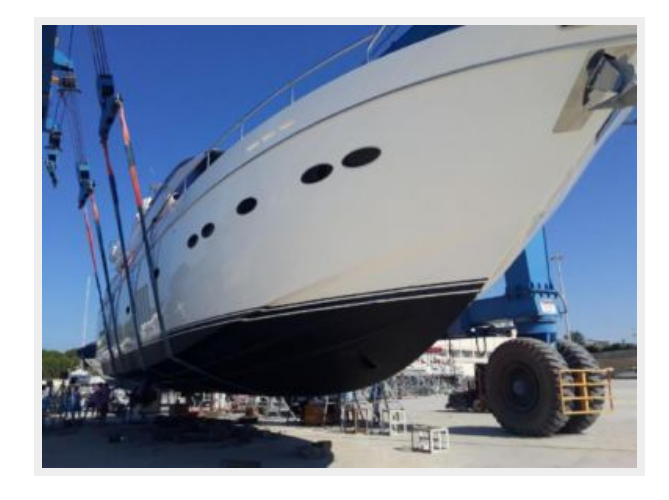
85 Princess Yacht