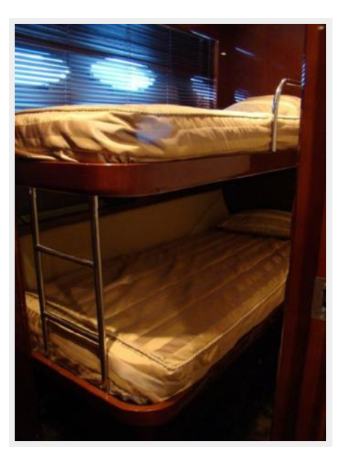
85 Princess Yacht