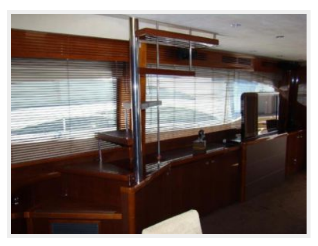
85 Princess Yacht