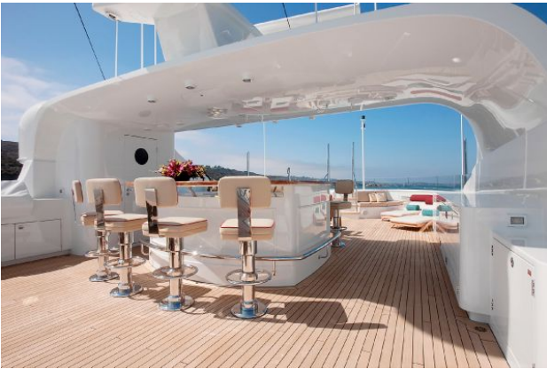
Upper sundeck bar