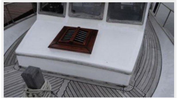
NEW PICTURE JANUARY 14, 2014 Foredeck