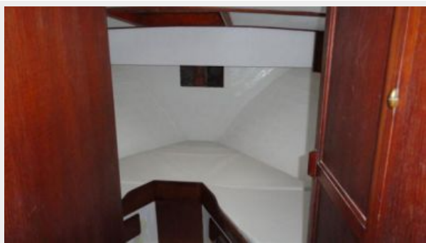
NEW PICTURE JANUARY 14, 2014 Forward Berth