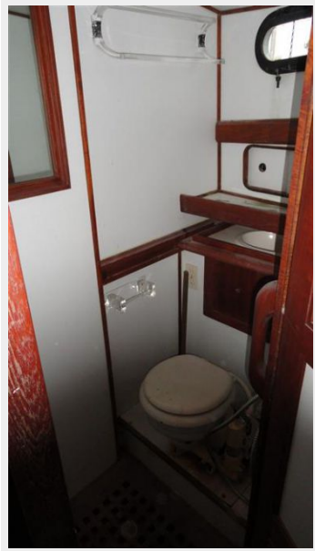
NEW PICTURE JANUARY 14, 2014 Head