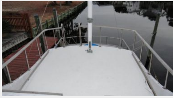
NEW PICTURE JANUARY 14, 2014 Exterior