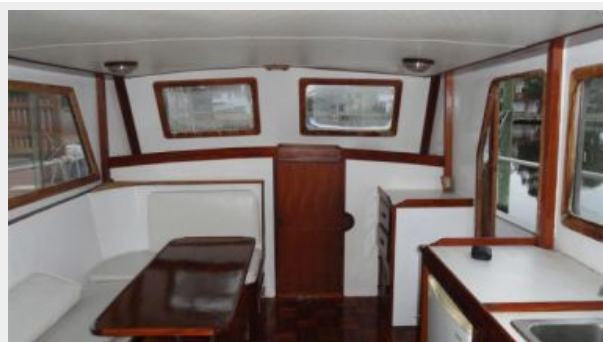
NEW PICTURE JANUARY 14, 2014 Salon