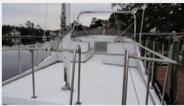
NEW PICTURE JANUARY 14, 2014 Bridge