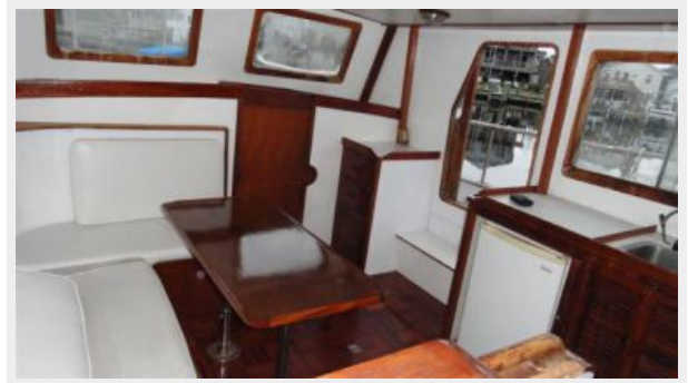
NEW PICTURE JANUARY 14, 2014 Interior