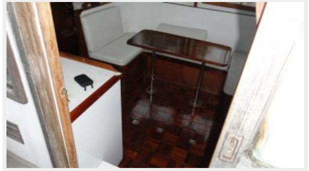
NEW PICTURE JANUARY 14, 2014