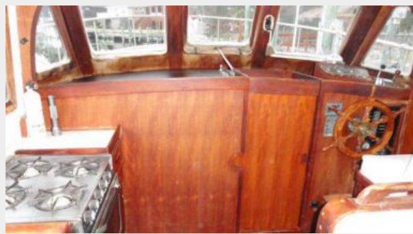
NEW PICTURE JANUARY 14, 2014 Woodwork