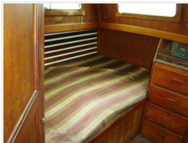
Other cabin picture