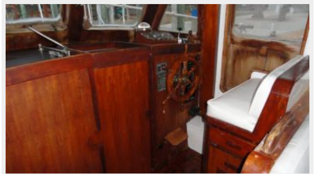
NEW PICTURE JANUARY 14, 2014 Lower Helm