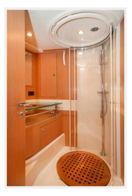
Guest Bath with Shower