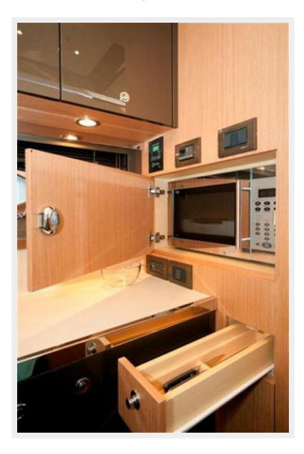
Stateroom and Bath