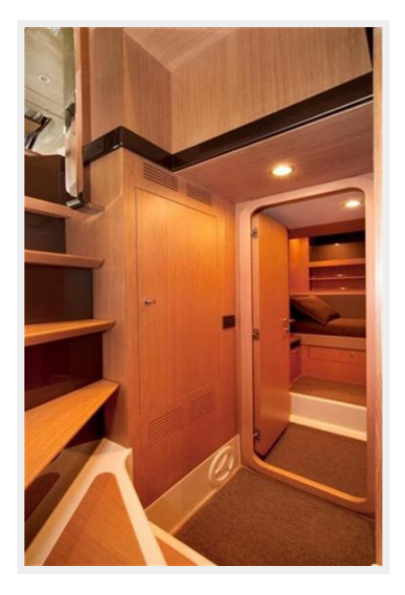
Stair to Below Deck