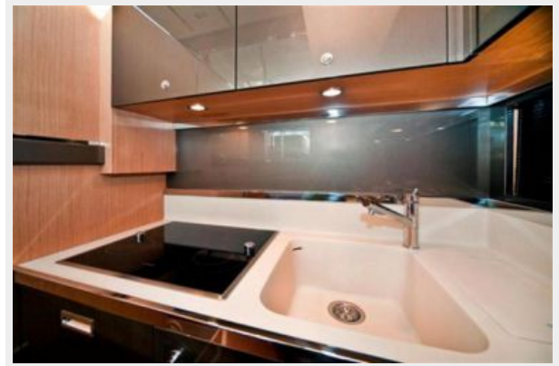
Cook Top and Sink