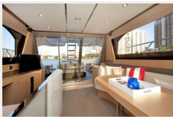
Salon from Helm