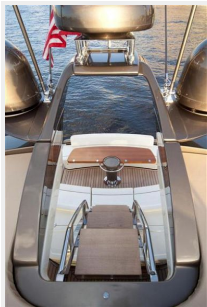
Fly Bridge Entertaining