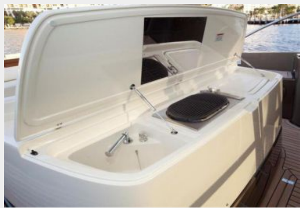
Fly Bridge Grill