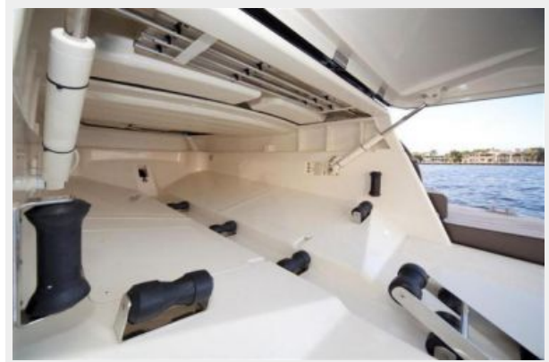
Garage for Tender