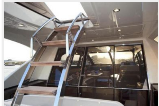
Stair from Aft to Fly Bridge