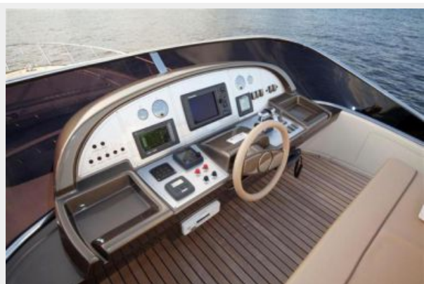
Fly Bridge Helm