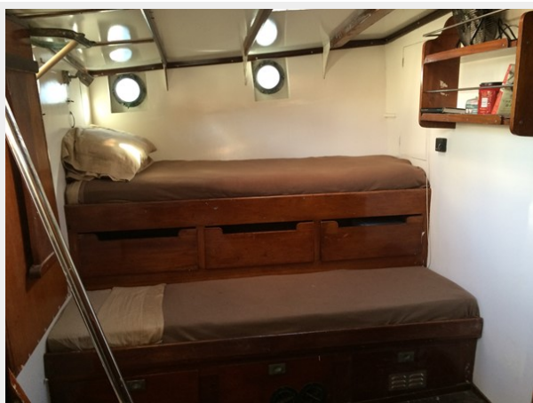
Fwd CABin Berths 1