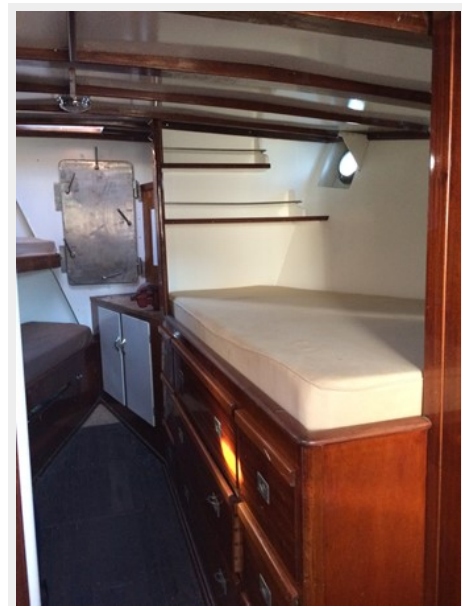
Fwd Cabin Berths 2