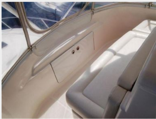
Flybridge VHF Remote Mic and Stereo