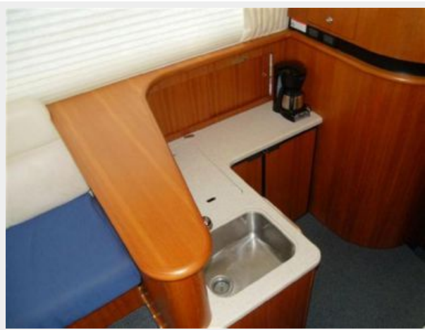
Galley Sink and Countertop