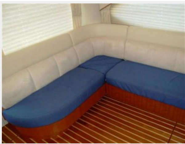
Salon Portside Sofa with Slide-Out Berth