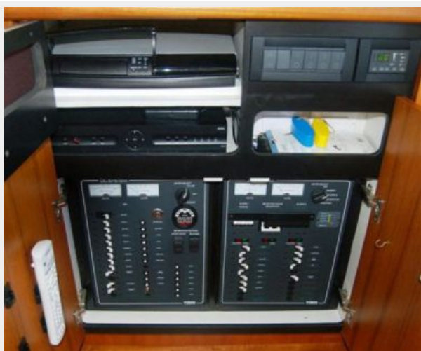
Master Distribution Panel