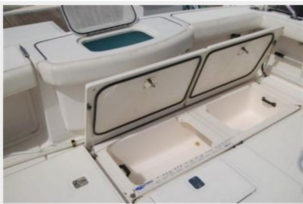
Cockpit Fishbox and Storage