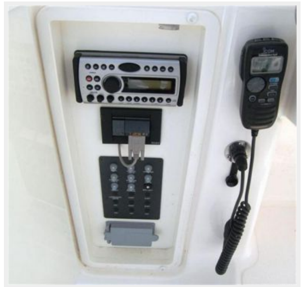
Flybridge VHF Remote Mic and Stereo