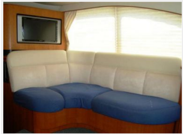
Starboard Seating in Salon