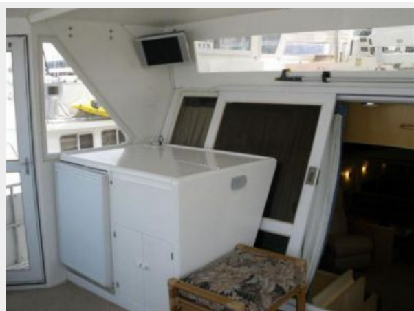
Wet Bar & TV