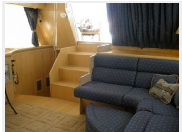
Salon Entry & Sofa