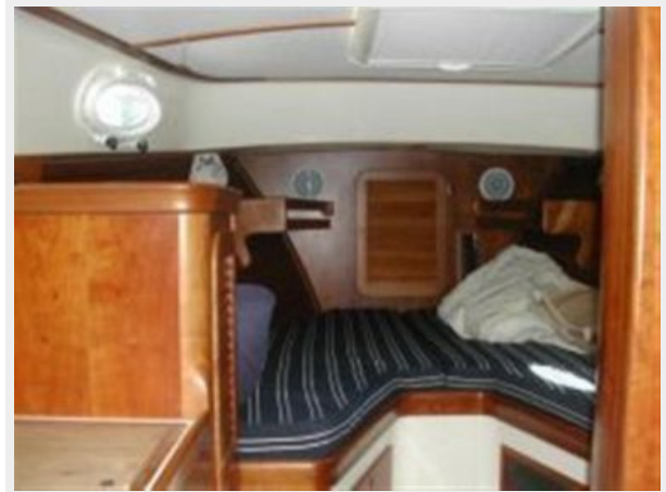
Fwd V-Berth (Sistership)