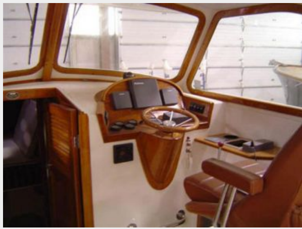
Helm, Pilothouse Stbd Side