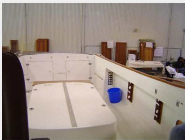
Cockpit/Insulated Engine Box