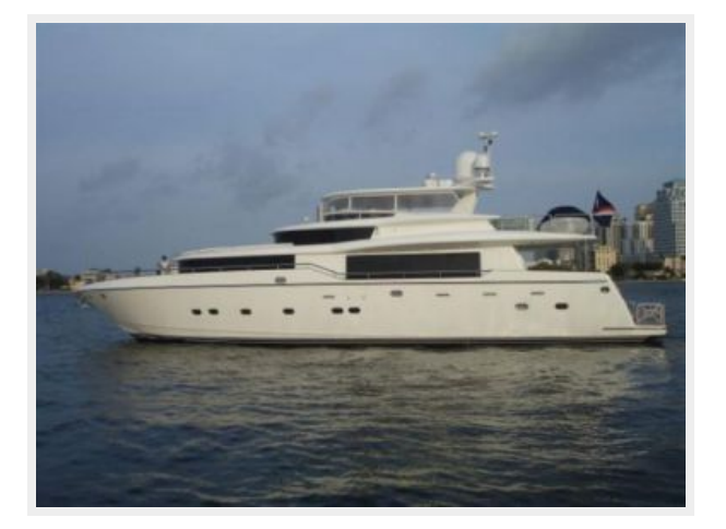
Massive Double Level Sunpads