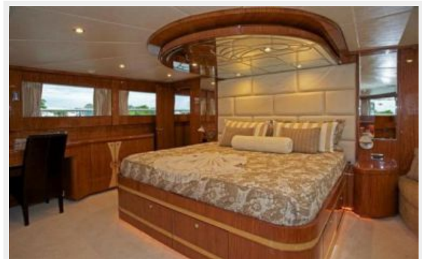
On Deck Master Stateroom