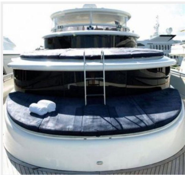
Massive Double Level Sunpads