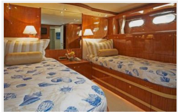
Guest Stateroom - Twin