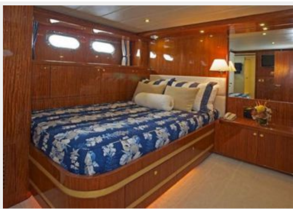
Guest Stateroom- Stbd