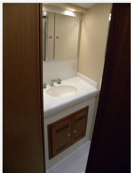
Master Head 1