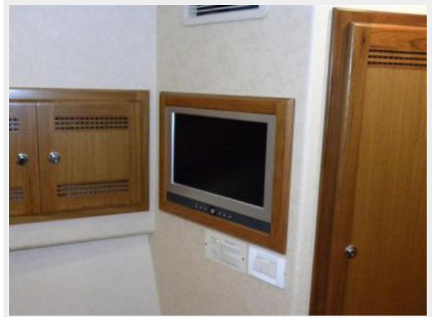
Entertainment in Master Stateroom