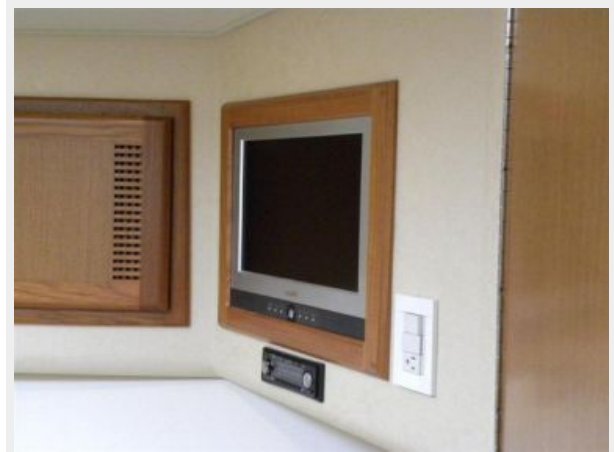
Entertainment in VIP Stateroom