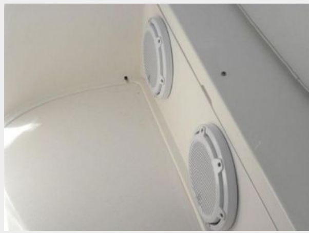
Custom Stereo 2