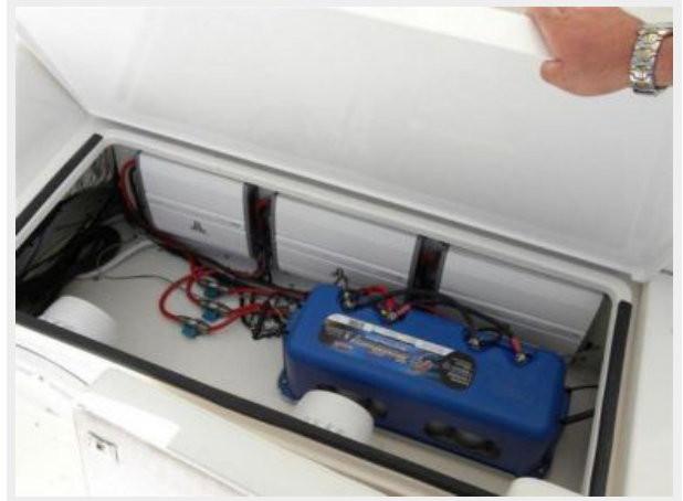
Custom Stereo 1