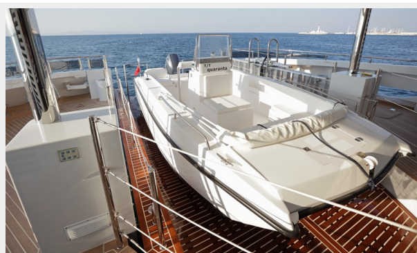
tender storage underway