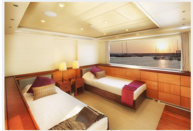
guest cabin in twin configuration