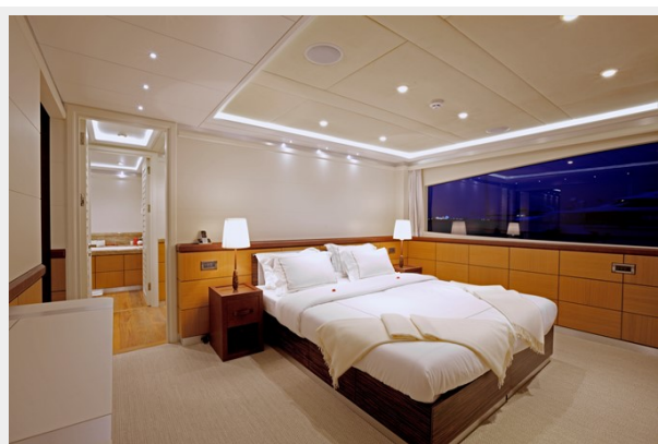
master cabin in double/suite configuration