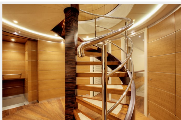
stairs to saloon deck