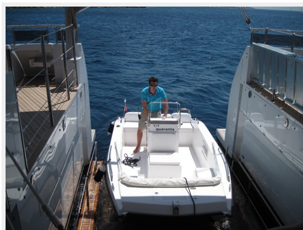
stern platform down for tender launch