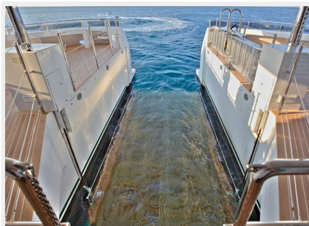
stern platform down for tender launch