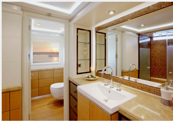
master cabin bathroom