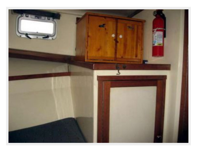
Starboard Hanging Locker