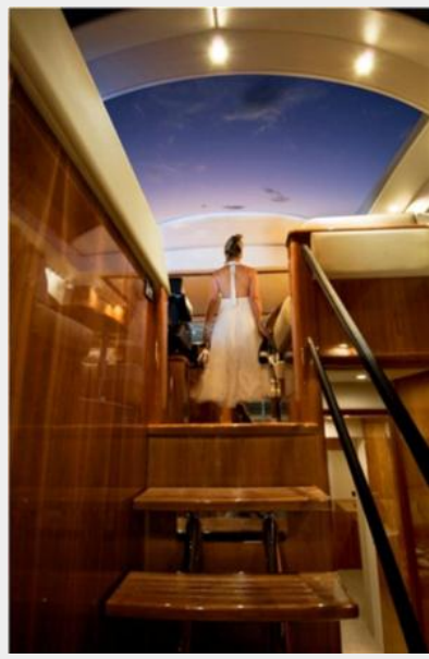
Saloon - Optional Layout