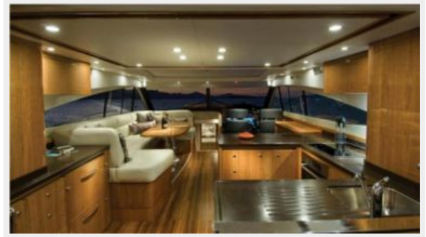
Saloon - Optional Layout