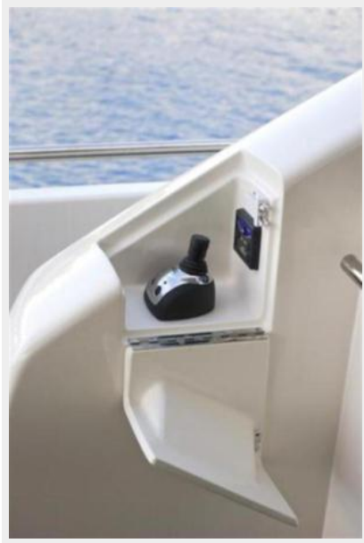
IPS Aft Docking Station