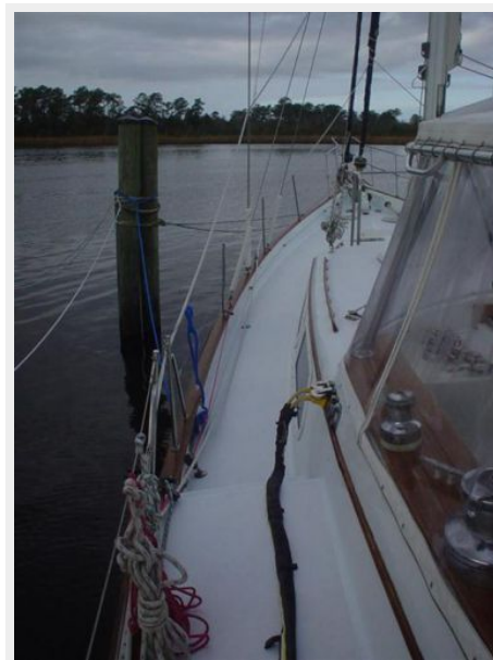
Port Deck Forward