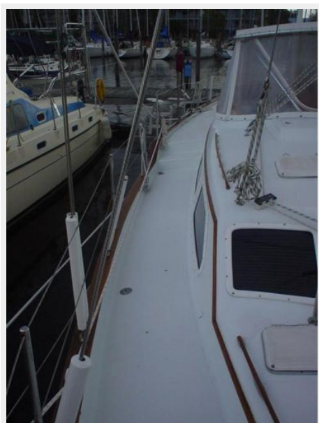
Starboard Deck Aft