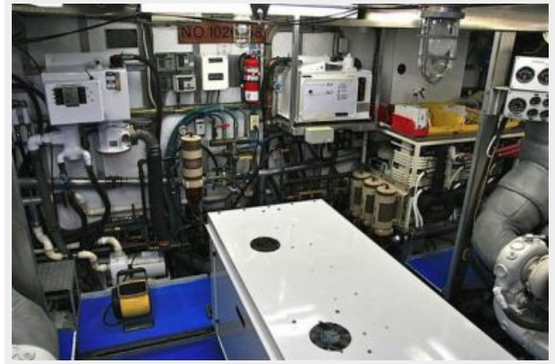
Engine room 2