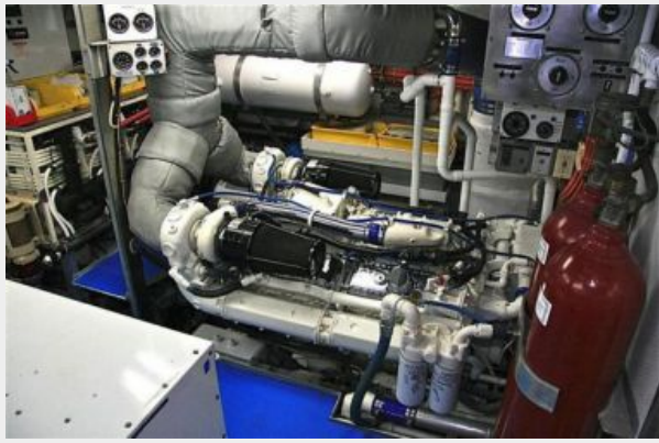
Engine room 1