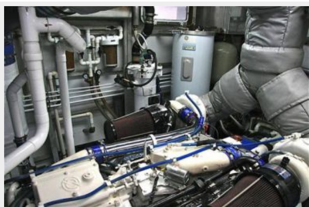
Engine room 3