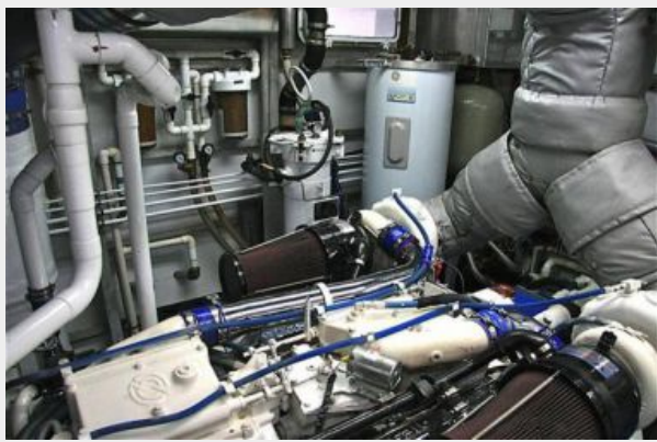
Engine room 3