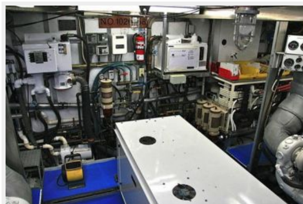
Engine room 2