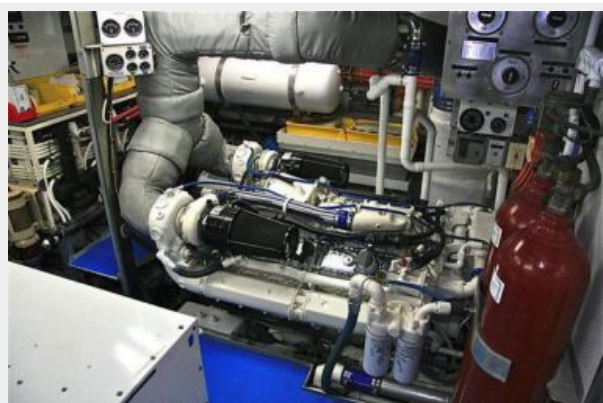
Engine room 1