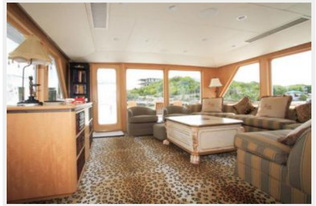
Salon looking aft