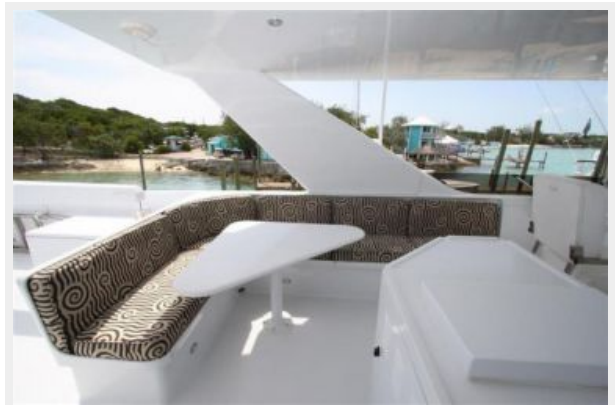
Flybridge lounge seating