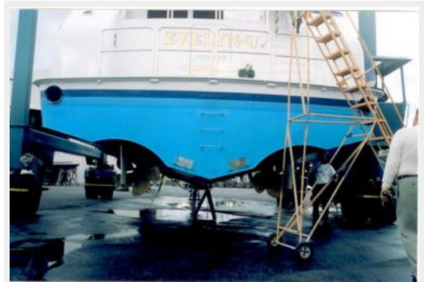
Stern - Out of water