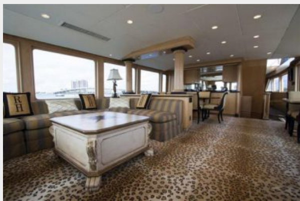
Salon looking fwd