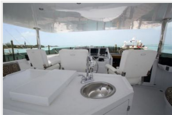
Flybridge - wet bar, bbq