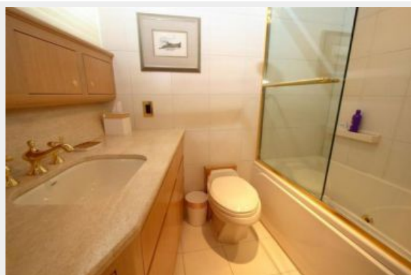
Master - Her bath