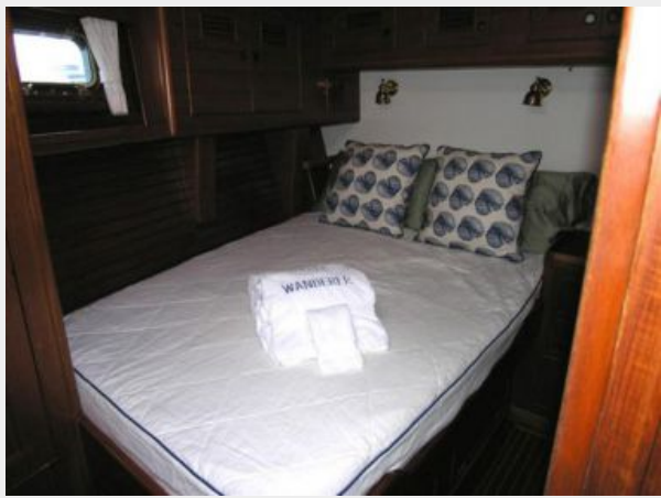
Guest Stateroom Starboard