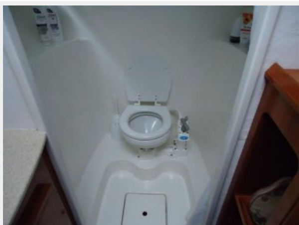
Head and shower