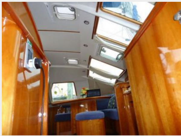
Plenty of natural light