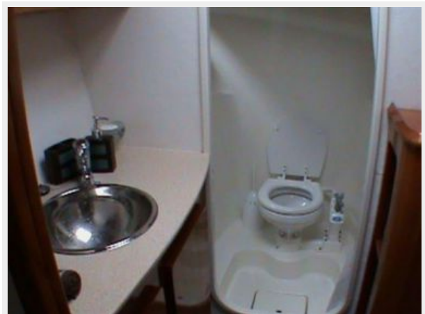
Master Head area