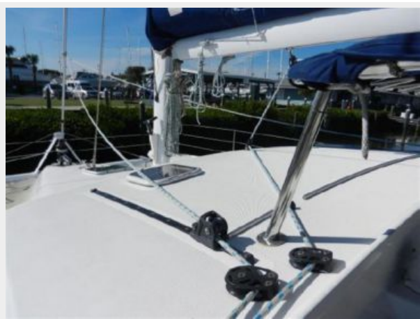
Lines to Cockpit