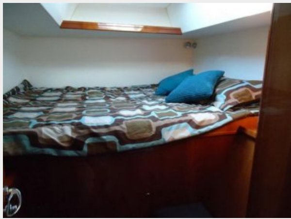
Stbd Guest berth