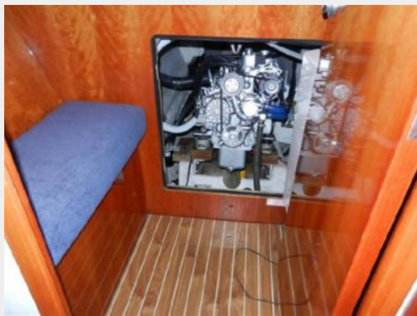
Engine Under Port Berth