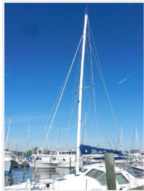
Mast and Rigging