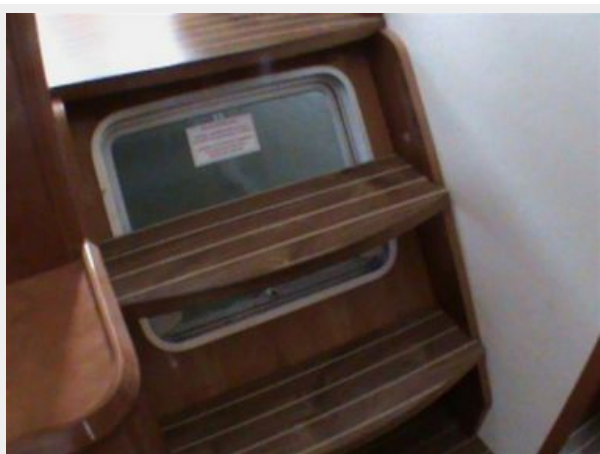
Port Escape Hatch