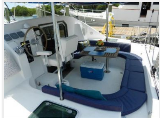
Plenty of Room for Guests!