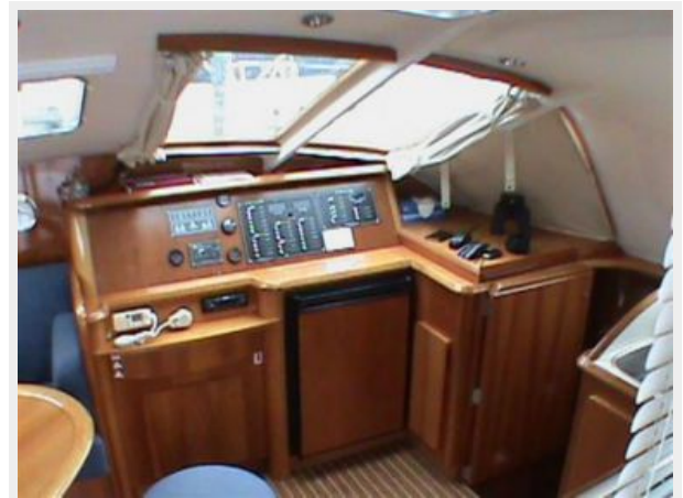
Station and Refrigerator