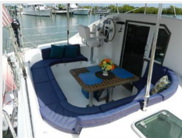
Large Shaded Cockpit