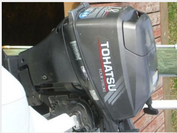
44' Tollycraft tender outboard