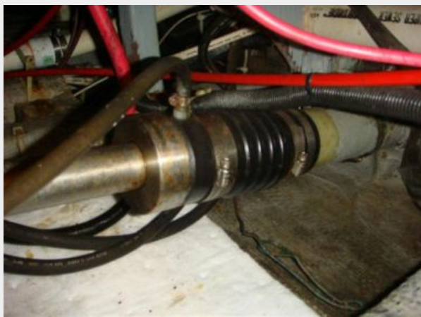
44' Tollycraft starboard shaft seal