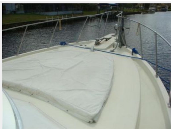
44' Tollycraft foredeck