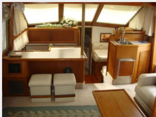
44' Tollycraft salon forward