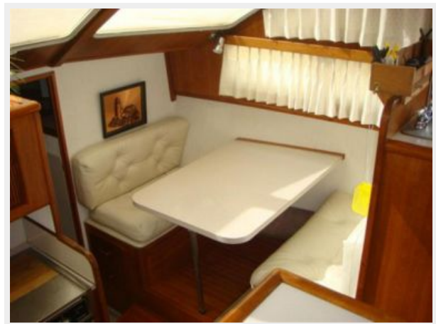
44' Tollycraft dinette2