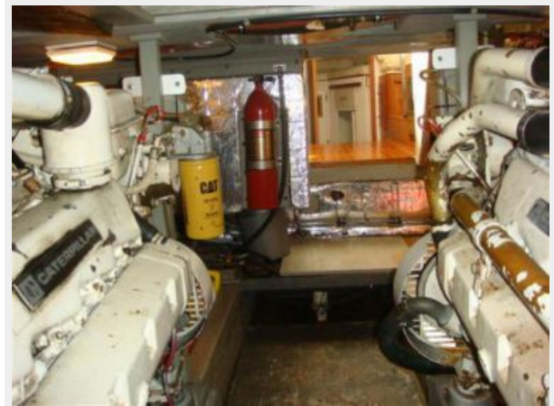
44' Tollycraft engine room forward