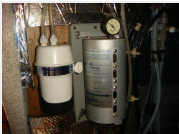
44' Tollycraft engine room starboard forward