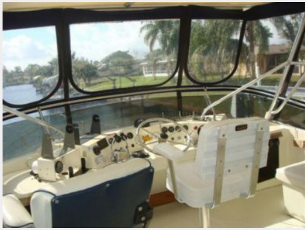
44' Tollycraft flybridge forward