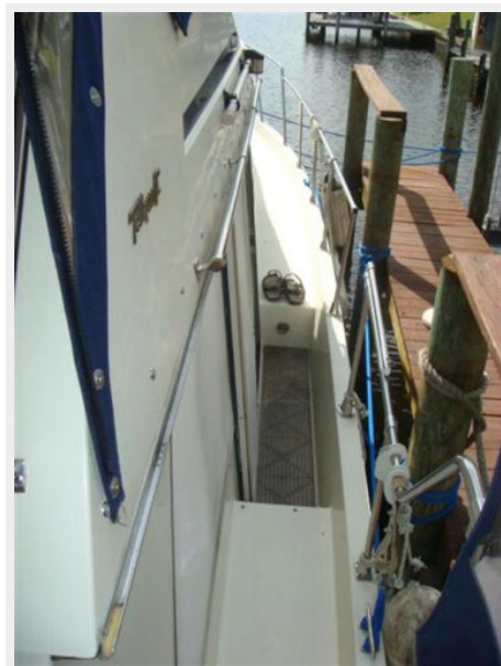
44' Tollycraft starboard side deck