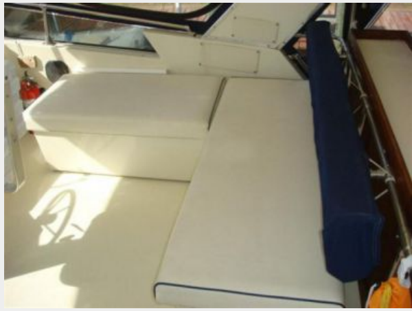
44' Tollycraft flybridge seating2