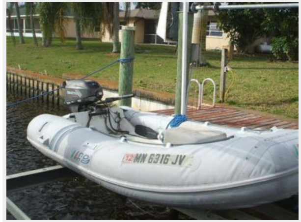
44' Tollycraft tender