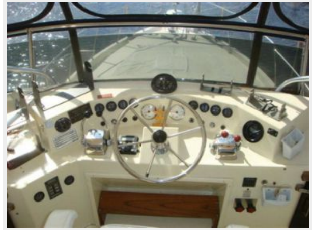
44' Tollycraft flybridge console