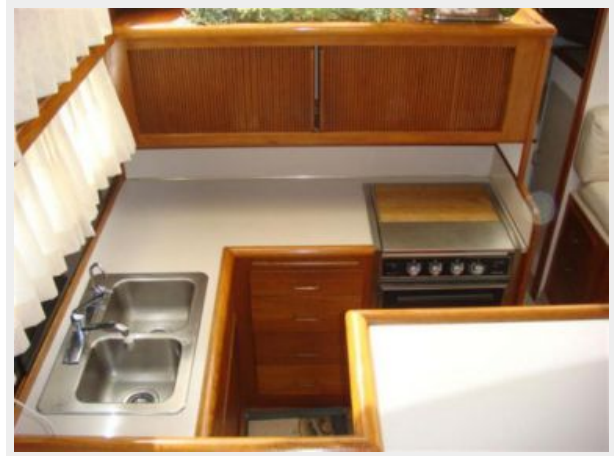
44' Tollycraft galley3