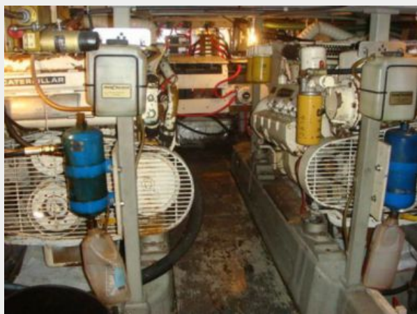
44' Tollycraft engine room aft