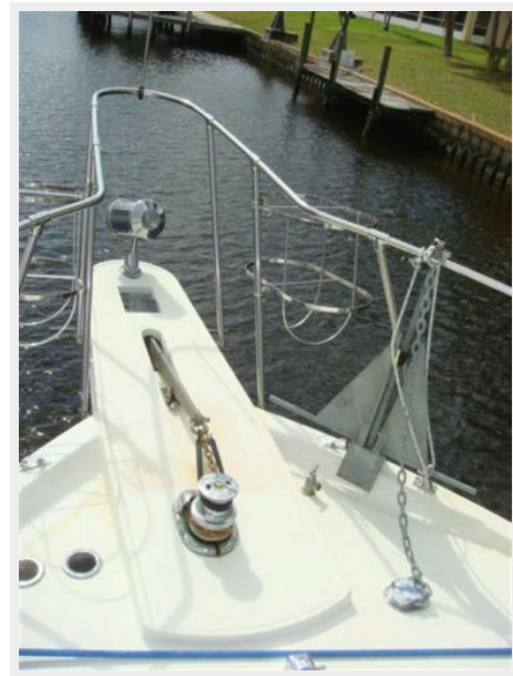
44' Tollycraft anchor windlass