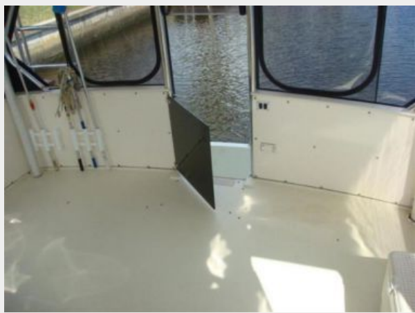
44' Tollycraft sundeck aft