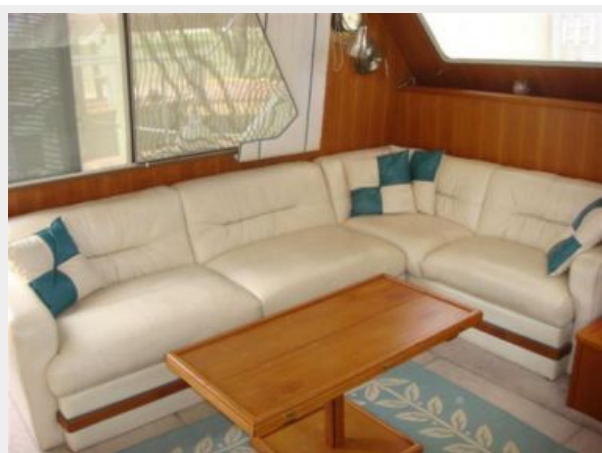
44' Tollycraft salon seating