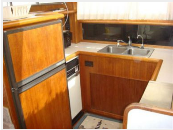
44' Tollycraft galley2