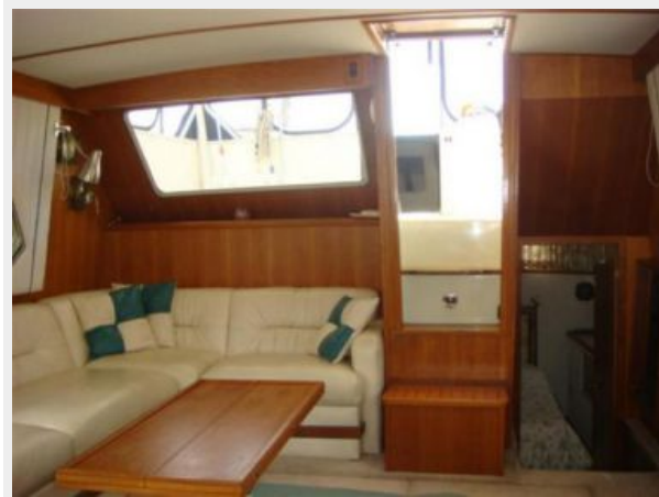
44' Tollycraft salon aft