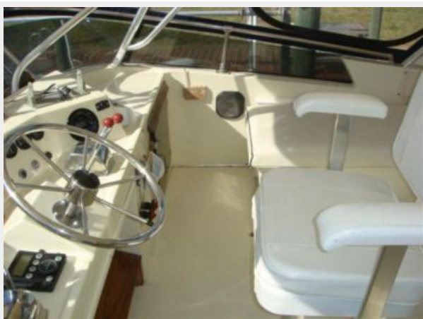
44' Tollycraft flybridge starboard