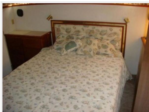
44' Tollycraft master stateroom