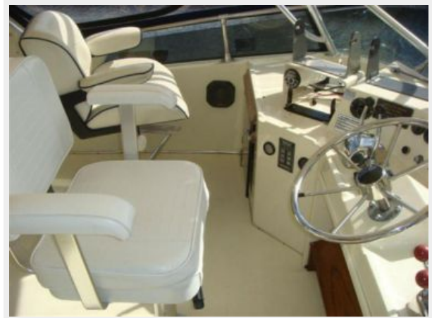
44' Tollycraft flybridge port