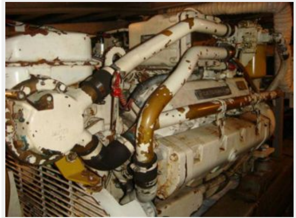
44' Tollycraft starboard main engine