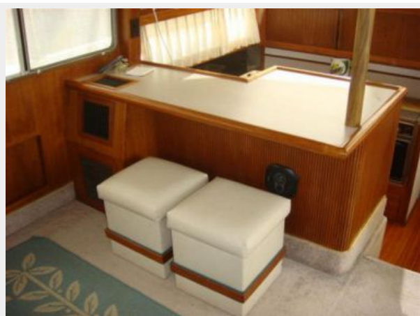
44' Tollycraft salon port forward