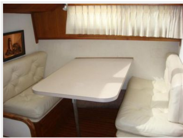
44' Tollycraft dinette1