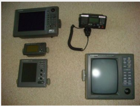
44' Tollycraft electronics