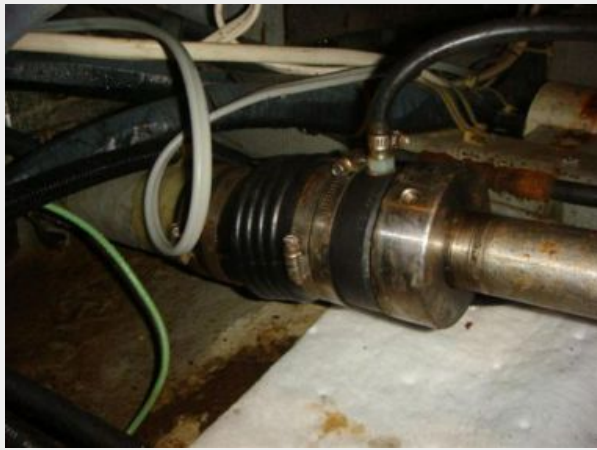
44' Tollycraft port shaft seal