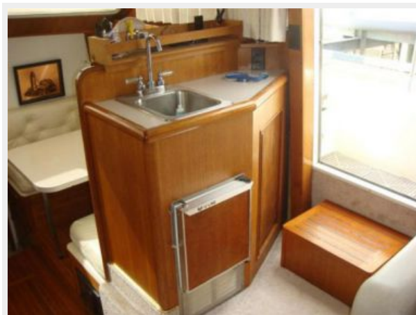
44' Tollycraft salon wetbar