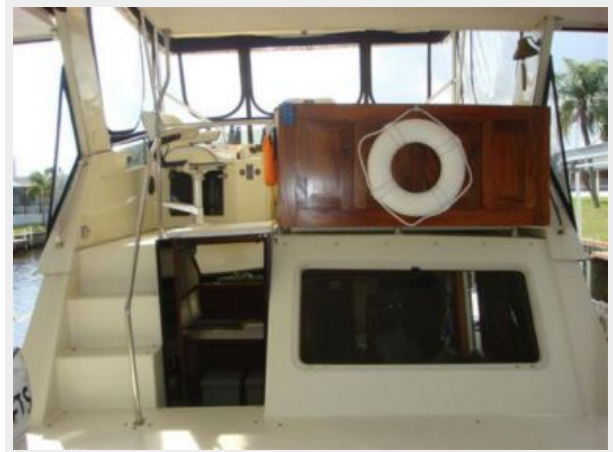
44' Tollycraft sundeck forward