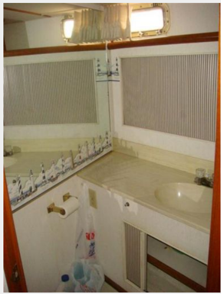
44' Tollycraft guest stateroom head