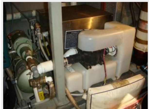
44' Tollycraft engine room starboard