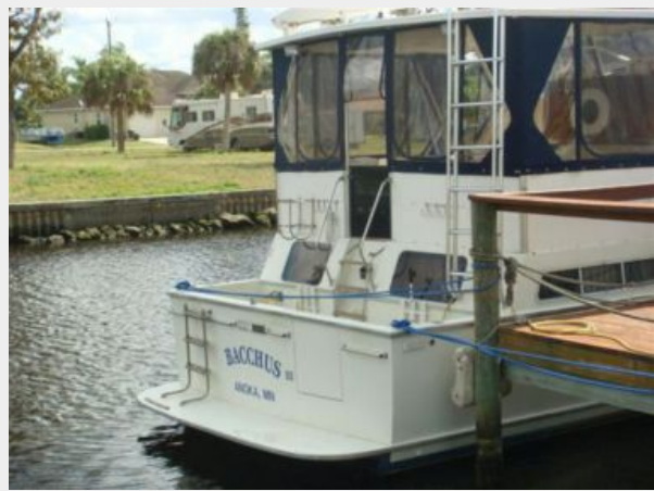
44' Tollycraft starboard aft profile