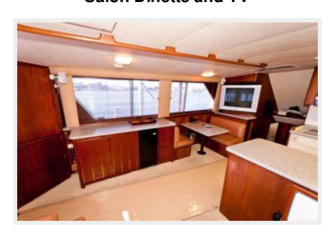
Salon Dinette and TV