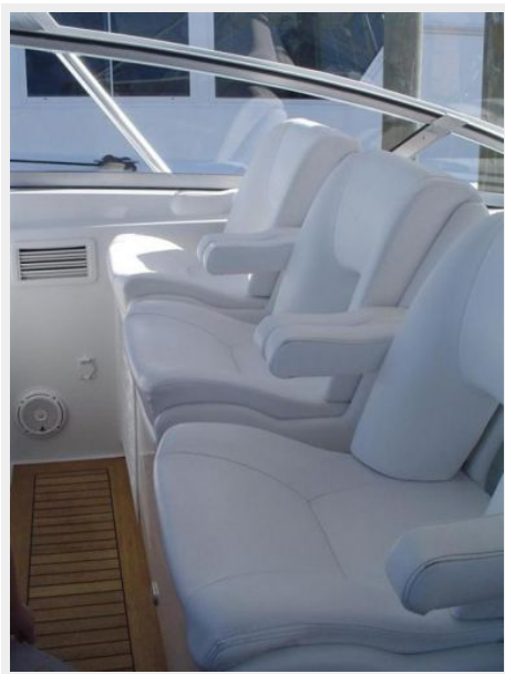
Bridge Helm Seating