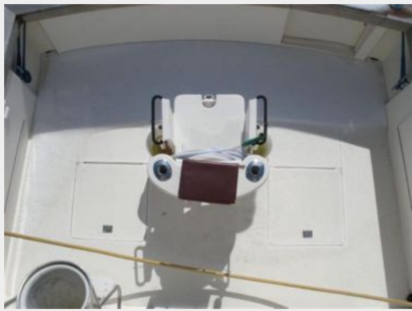
Cockpit and Fighting Chair