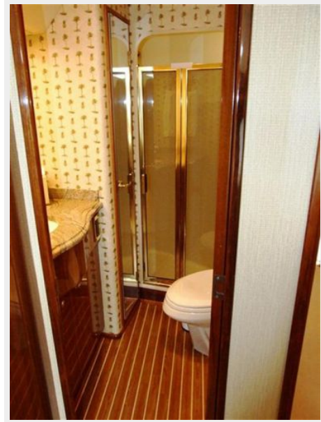
Starboard Stateroom Forward