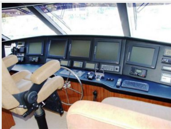
Fly Bridge Electronics