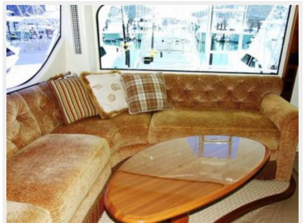
Fly Bridge Sofa