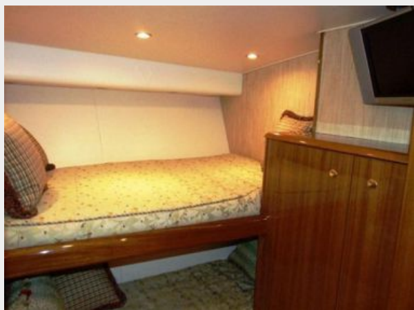
Starboard Stateroom Forward