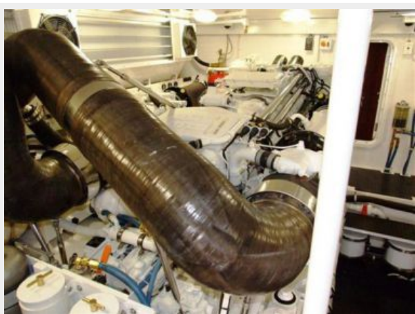
Engine Room Port