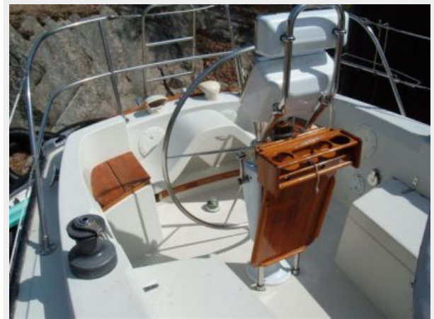
Cockpit w/ST winches close to steering