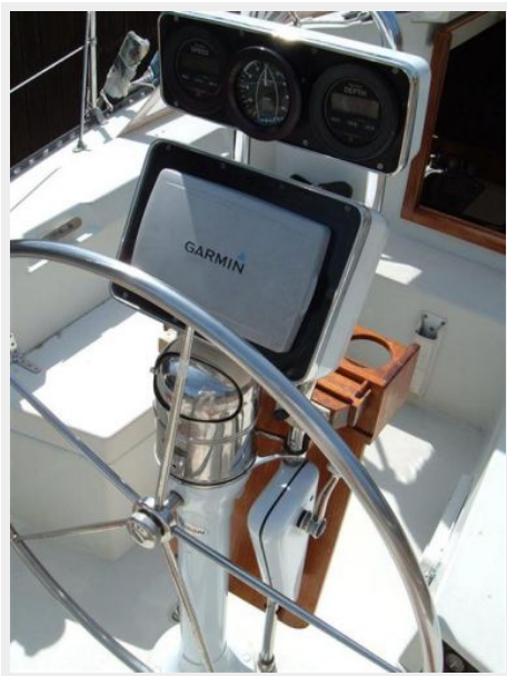
New pedestal w/single lever engine control