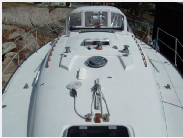
Deck aft / newer hatches