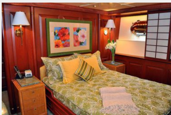
Guest Stateroom, Port