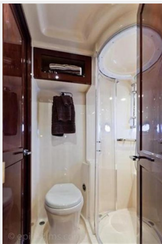
Guest Head / Shower