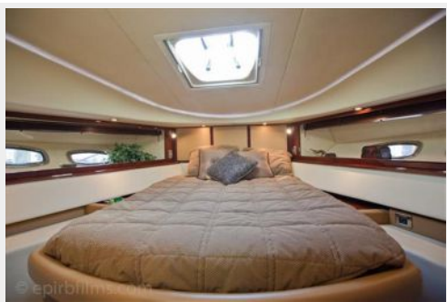
Forward Stateroom 2