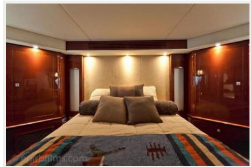
Master Stateroom 2