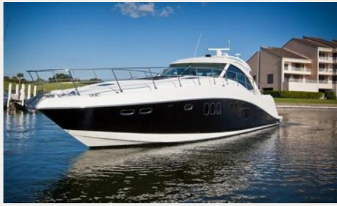
On Plane Profile