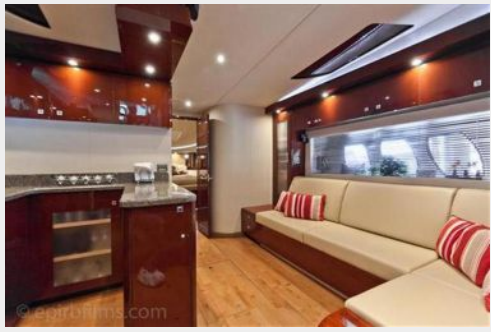
Salon and Galley