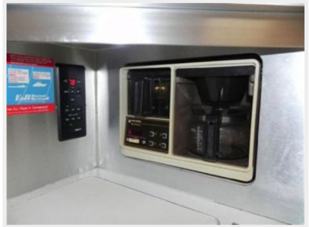
Head w/ Enclosed Shower