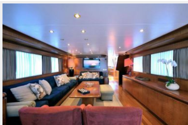
Main Salon Aft