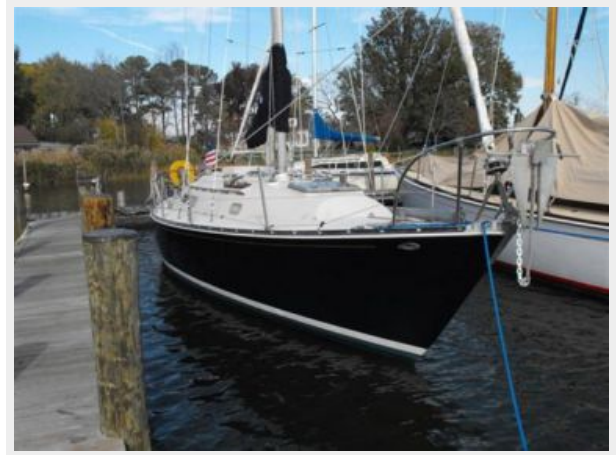
35' C&C starboard forward profile