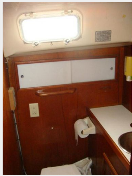
35' C&C head