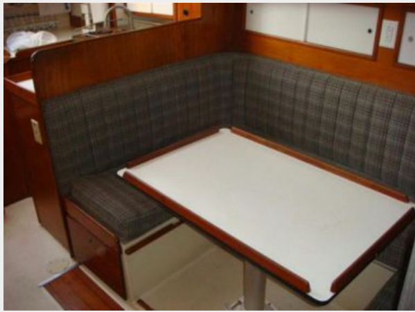
35' C&C dinette2