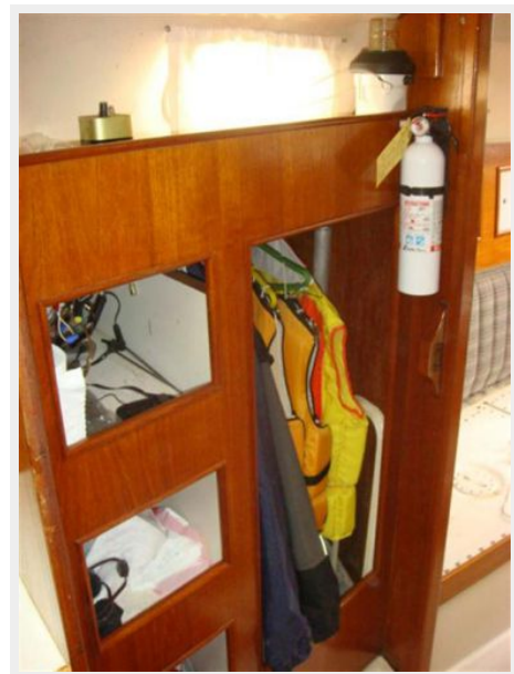
35' Master stateroom storage