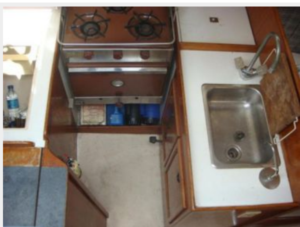
35' C&C galley2