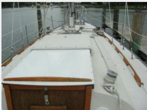
35' C&C foredeck2