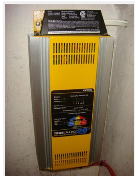
35' C&C battery charger