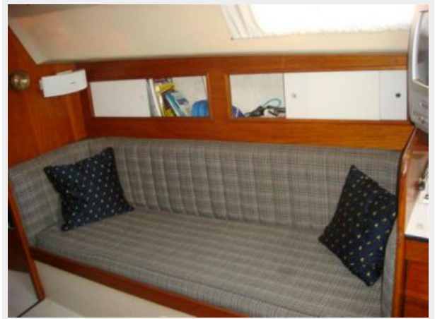
35' C&C salon starboard seating