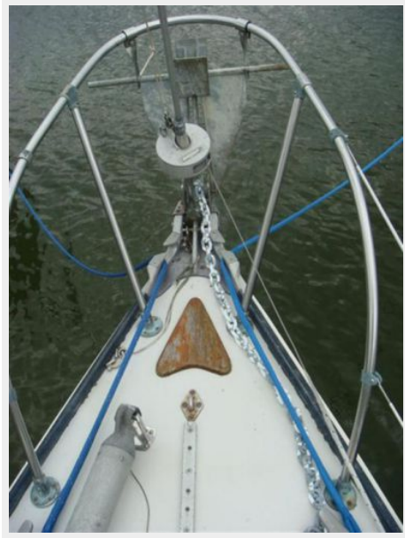
35' C&C pulpit