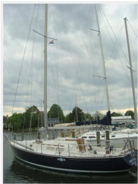
35' C&C port aft profile