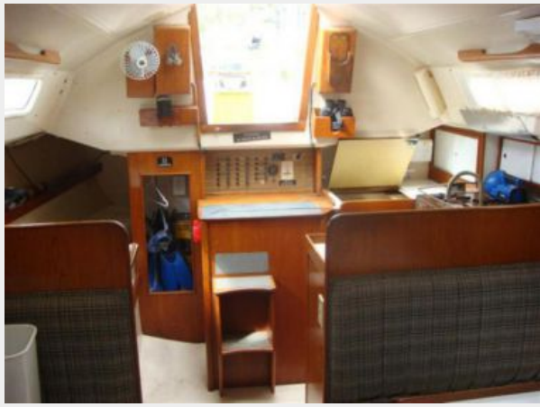
35' C&C salon aft