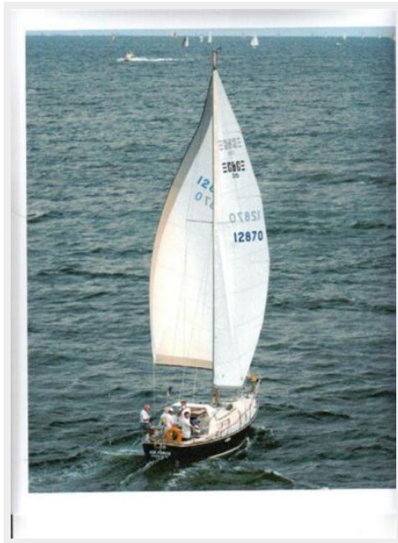
35' C&C underway