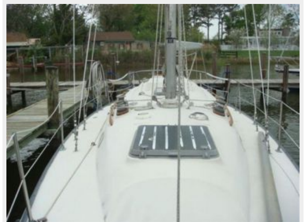
35' C&C foredeck aft