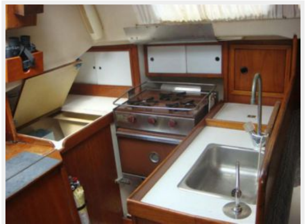
35' C&C galley1