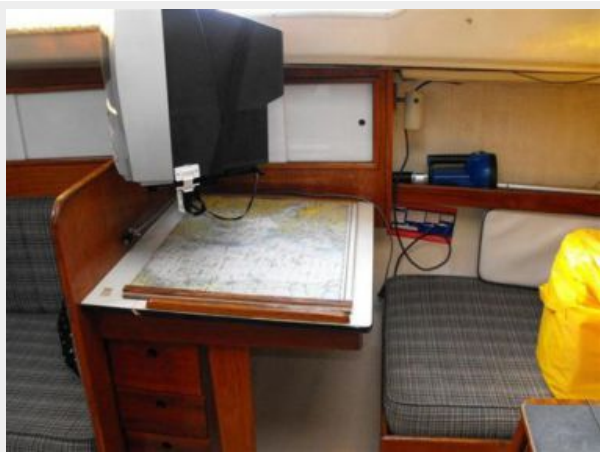
35' C&C nav station