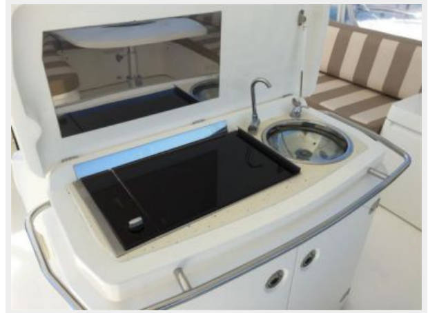
Flybridge - Grill and Sink