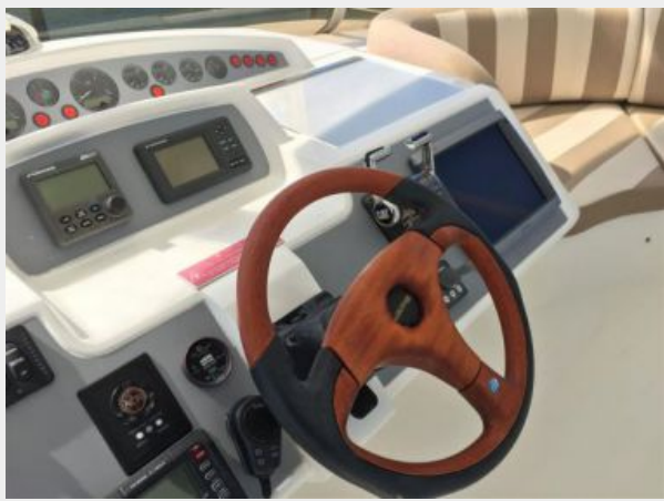
Flybridge - Helm