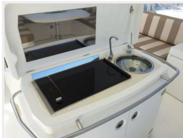
Flybridge - Grill and Sink