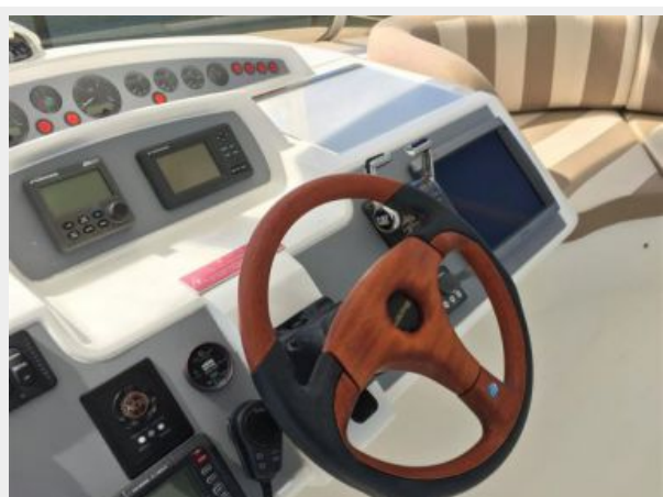
Flybridge - Helm