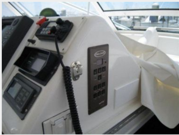
Helm 4 - Electronics