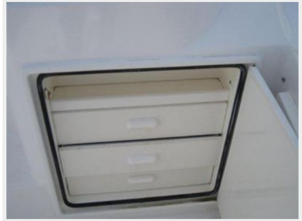
Fishing Equipment 3