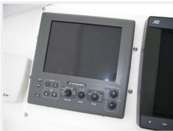
Helm 8 - Furuno FVC 1100L