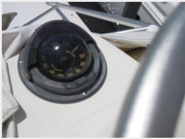
Helm 10 - Compass