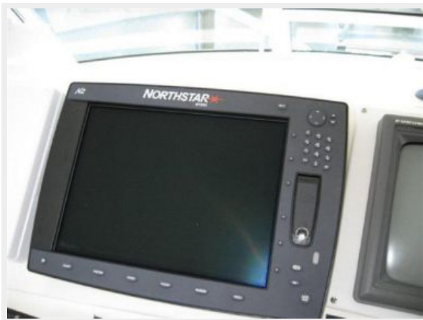
Helm 6 - Northstar 6100i