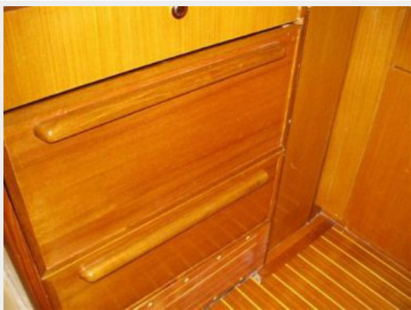
Master Stateroom 3