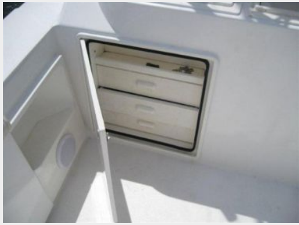
Fishing Equipment 2