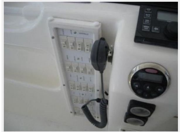
Helm 5 - Electronics