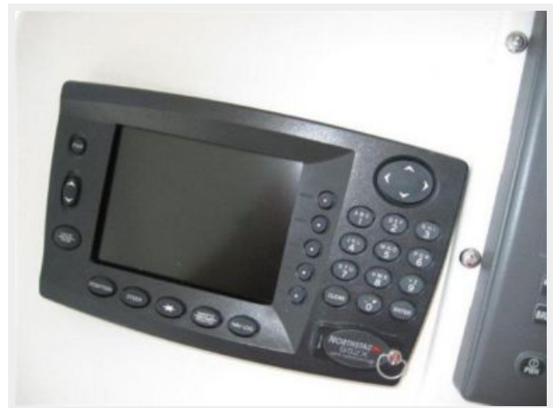
Helm 7 - Northstar 952X