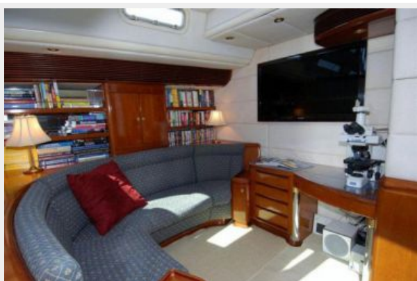
Lower Salon Port